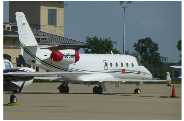
Gulfstream G150 Engine Cover Set