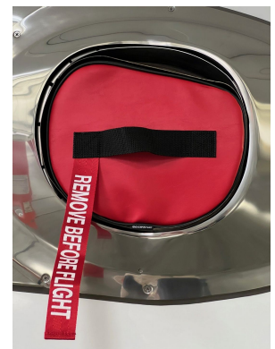
Gulfstream V APU Exhaust Plug