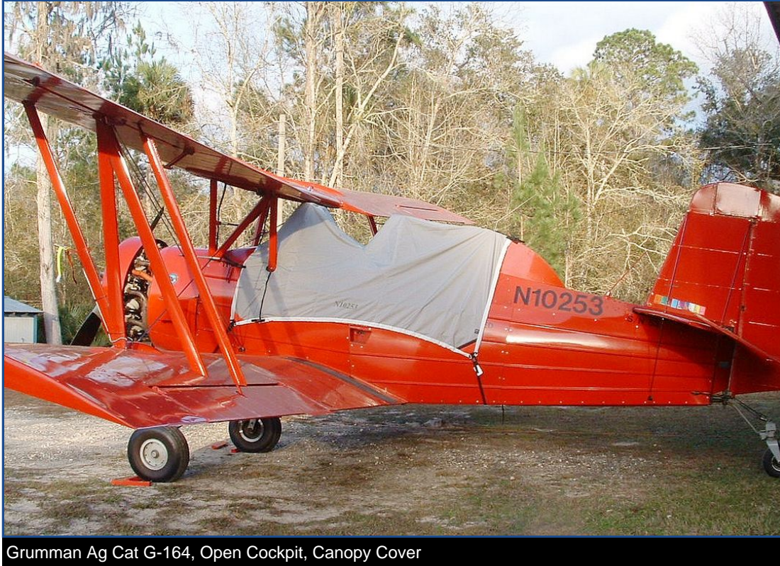
Grumman Ag Cat G-164, Open Cockpit, Canopy Cover