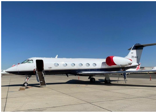
Grumman Gulfstream G-IV SP Engine Cover, bikini type

The Gulfstream Aerospace Gulfstream II, III (C-20D) Intake Covers are designed to install easily yet be completely storable. A spring steel hoop is sewn into the hem of each cover, allowing them to be installed without climbing onto the wing or using a stepladder. To store the covers the spring steel hoop folds like a band-saw blade into three nesting rings. Each cover folds into a compact circular bundle which is stored in the included duffle bag, yet they unfold quickly for use. The Tri-Fold Ring cover is made of medium weight nylon which is available in a variety of colors to match the paint trim. Each cover set comes complete with installation and folding instructions. The aircraft's registration number can be silkscreened onto the cover for an extra charge.