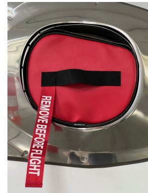
Gulfstream V APU Exhaust Plug