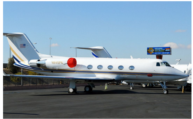
Grumman Gulfstream II Intake Covers