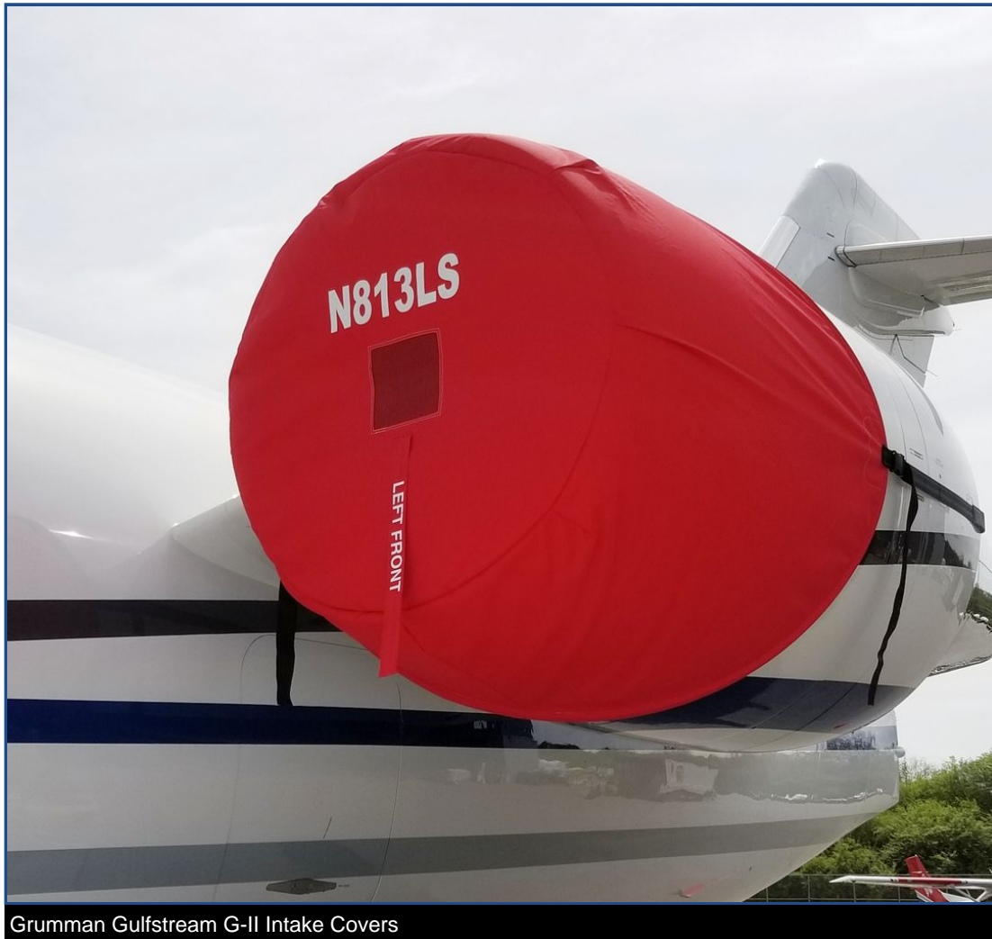
Grumman Gulfstream G-II Intake Covers