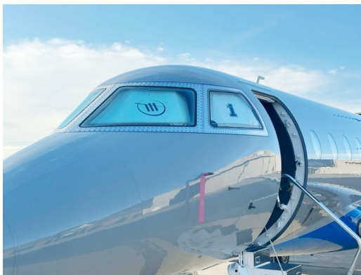
Gulfstream G200 Cockpit Heatshields

Cockpit Heatshields are interior sunshades for the aircraft's cockpit. The product is a unique composite of closed-cell foam with a silver mylar finish. The semi-rigid design is stiff enough to stand inside the window framing. The set folds up flat and is easily stored in the included storage sleeve. Some designs may require velcro and suction cups. Our Heatshields for jets are offered white side out because some aircraft manufacturers have issued advisories against reflective window inserts due to potential heat damage. A Heatshield is an excellent short-term remedy for cockpit overheating, but an external fabric cover is more effective for long-term protection.