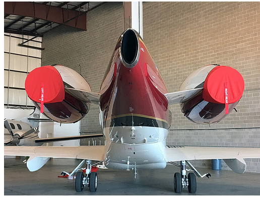
Canadair Challenger 300 Intake/Exhaust Covers, 3-Strap Type