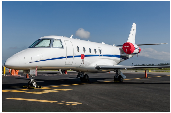
Gulfstream G150 Engine Covers, Cockpit HeatShields