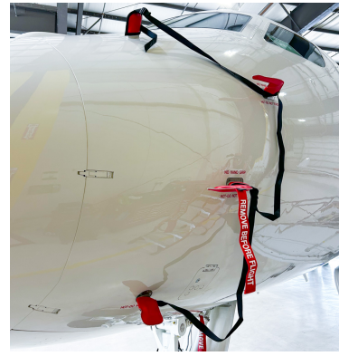
Gulfstream GVII Pitot Probes/TAT/Ice Detector Set, Heat Resistant Type