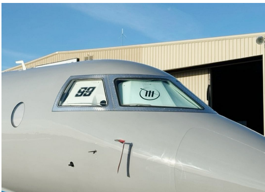
Gulfstream G200 Cockpit Heatshields

Cockpit Heatshields are interior sunshades for the aircraft's cockpit. The product is a unique composite of closed-cell foam with a silver mylar finish. The semi-rigid design is stiff enough to stand inside the window framing. The set folds up flat and is easily stored in the included storage sleeve. Some designs may require velcro and suction cups. Our Heatshields for jets are offered white side out because some aircraft manufacturers have issued advisories against reflective window inserts due to potential heat damage. A Heatshield is an excellent short-term remedy for cockpit overheating, but an external fabric cover is more effective for long-term protection.