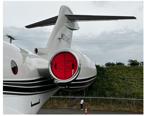
Gulfstream G280 Intake Plugs