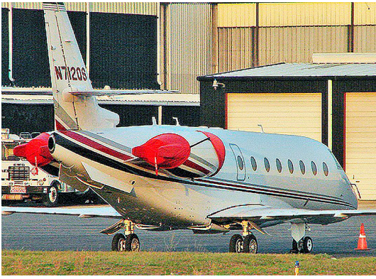
Gulfstream 200 Engine Cover set