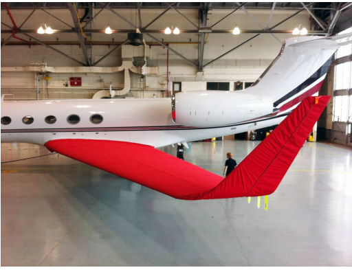
Gulfstream G550 Wing/Winglet Covers