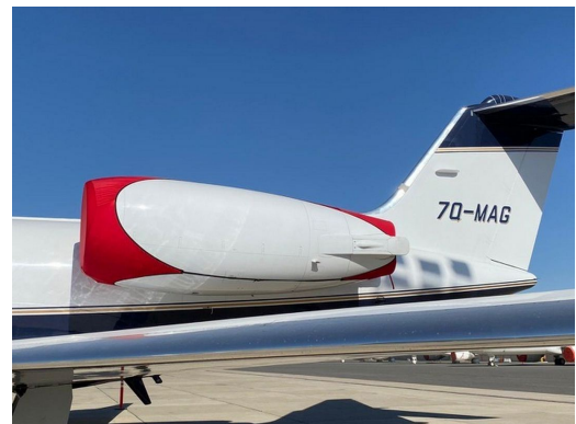
Grumman Gulfstream G-IV SP Engine Cover, bikini type