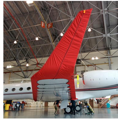
Gulfstream G550 Wing/Winglet Covers