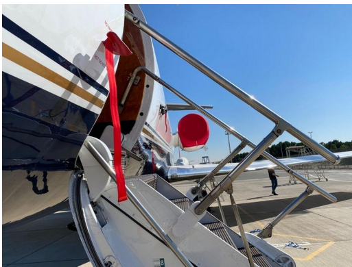
Grumman Gulfstream G-IV SP Pitot Cover

The Engine Inlet Plugs are custom fit for your Gulfstream Aerospace Gulfstream IV (C-20G), G350, G450 intakes, made with heavy-duty vinyl material, and stuffed with a single block of sculpted urethane foam. Each plug has a zipper that allows the foam to be removed and dried if necessary. Engine plugs have 'remove before flight' streamers sewn onto the face of the plugs. Most plugs are imprinted with the aircraft registration number in black for an extra charge. Storage bag NOT included. Engine plugs may be inserted after flight when the engine is still warm. Engine Inlet Plugs are commonly referred to as Cowl Plugs, Intake Plugs, Cowl Blocks, Engine Blocks, and Engine Bunges.