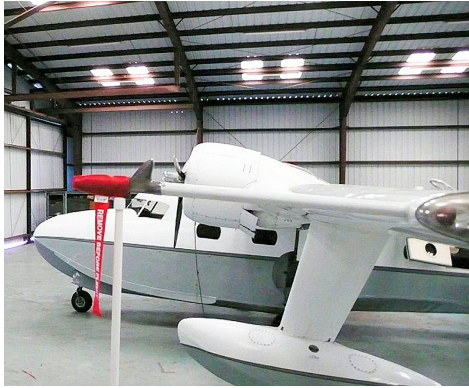
Grumman Mallard Pitot Cover with Install Tool

Canopy Covers are commonly referred to as Cabin Covers, Fuselage Covers, Canvas Covers, Canopy Caps, etc.