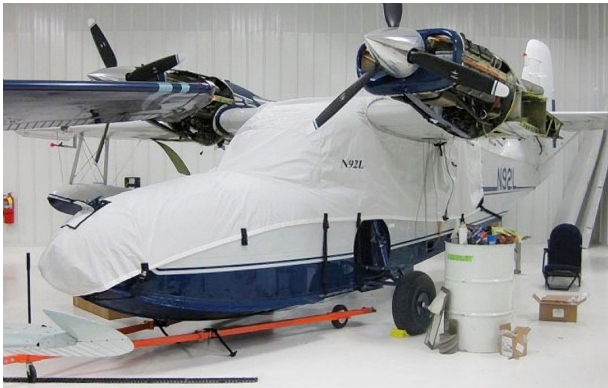
Grumman G44 Widgeon Canopy/Nose Cover