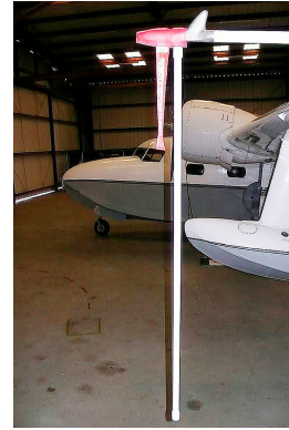
Grumman Mallard Pitot Cover with Install Tool