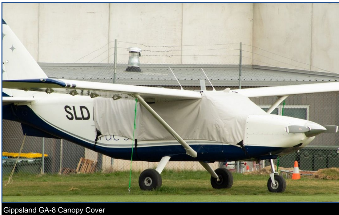
Gippsland GA-8 Canopy Cover