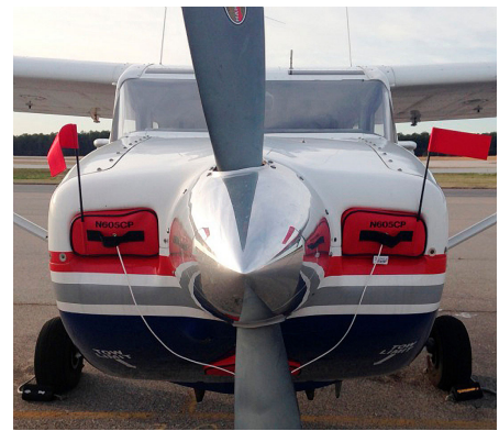
GA-8 Engine Inlet Plugs (set of 3)