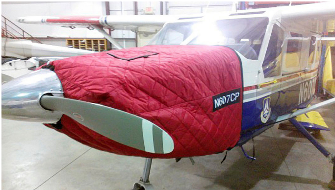
GA-8 Insulated Engine Cover

This cover type is made from Silver Acrylic Sunbrella canvas and is 100% lined with a soft and smooth microfiber. Bruce's Custom Covers developed this material combination especially for aircraft protection. The outer material is medium weight and treated for water resistance, UV resistance and anti-static buildup. The inner lining is a very soft and smooth microfiber to prevent scratching. The material is very reflective, and tests show that the cabin interior temperature can be reduced to near-ambient temperature on the hottest of days. It is water, ice and snow repellent, yet breathable to allow moisture to escape from between the cover and the aircraft surface.