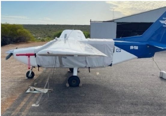
Gippsland GA-8 Extended Canopy Cover