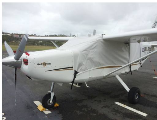
Gippsland GA-8 Airvan Canopy Cover