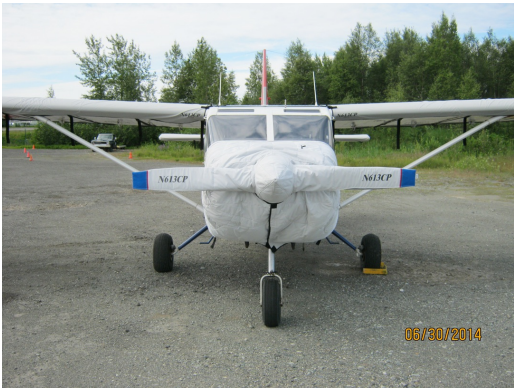
Gippsland GA-8 Airvan Insulated Engine and Prop Covers