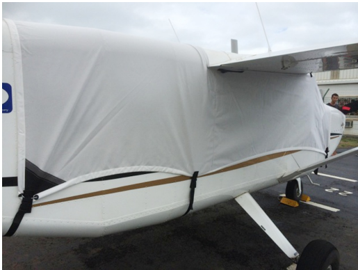
Gippsland GA-8 Airvan Canopy Cover

This cover type is made from Silver Acrylic Sunbrella canvas and is 100% lined with a soft and smooth microfiber. Bruce's Custom Covers developed this material combination especially for aircraft protection. The outer material is medium weight and treated for water resistance, UV resistance and anti-static buildup. The inner lining is a very soft and smooth microfiber to prevent scratching. The material is very reflective, and tests show that the cabin interior temperature can be reduced to near-ambient temperature on the hottest of days. It is water, ice and snow repellent, yet breathable to allow moisture to escape from between the cover and the aircraft surface.