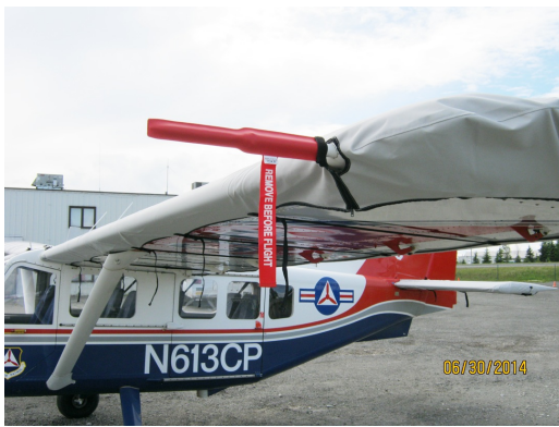
Gippsland GA-8 Airvan Wing Covers, Pitot Cover