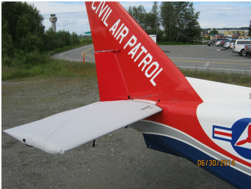
Gippsland GA-8 Airvan Horizontal Stab. Cover

shorter useful life if used continuously outside than the all-year use material.