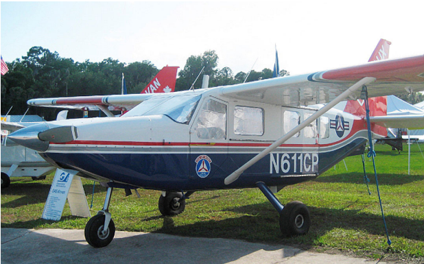
Gippsland GA-8 Airvan Cockpit & Cabin HeatShield Set

Cockpit Heatshields are interior sunshades for the aircraft's cockpit. The product is a unique composite of closed-cell foam with a silver mylar finish. The semi-rigid design is stiff enough to stand inside the window framing. The set folds up flat and is easily stored in the included storage sleeve. Some designs may require velcro and suction cups. A Heatshield is an excellent short-term remedy for cockpit overheating, but an external fabric cover is more effective for long-term protection.