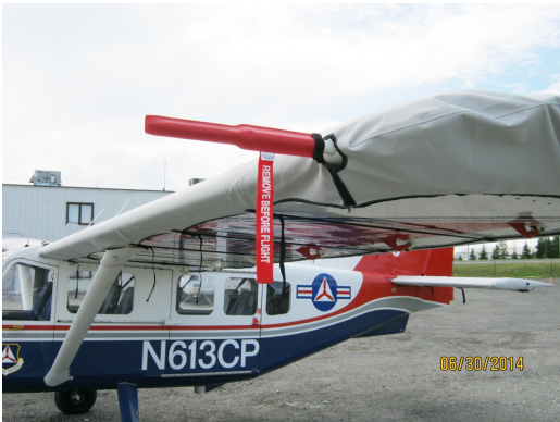
Gippsland GA-8 Airvan Wing Covers, Pitot Cover