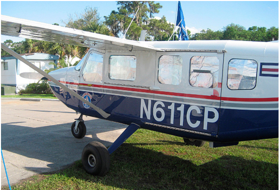
Gippsland GA-8 Airvan Cockpit & Cabin HeatShield Set