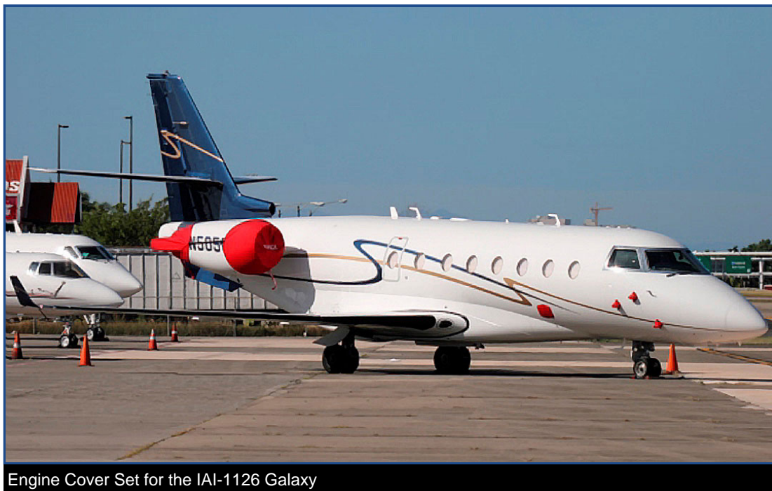
Engine Cover Set for the IAI-1126 Galaxy