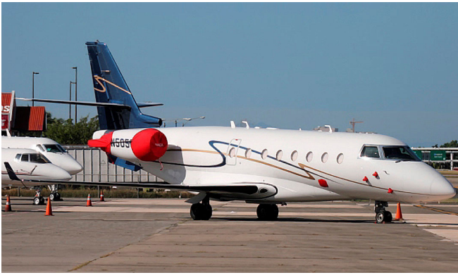
Engine Cover Set for the IAI-1126 Galaxy