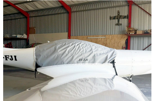
Gobosh 800XP Travel Cover, Light Weight Travel Canopy Cover and Inlet Plugs Gobosh 800XP Travel Cover, Light Weight Travel Canopy Cover