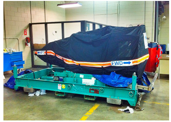
GE CF-34 QEC Engine Long-term Storage/Transport Cover "Bag"