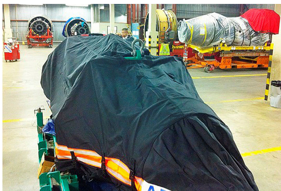
GE CF-3GE CF-34 QEC Engine Long-term Storage/Transport Cover "Bag"4 QEC Engine Long-term Storage/Transport Cover "Bag"