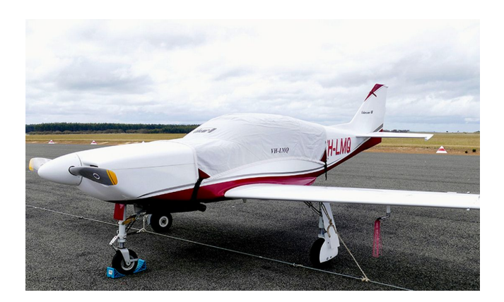
Glasair Aviation Glasair III Canopy Cover

This cover type is made from Silver Acrylic Sunbrella canvas and is 100% lined with a soft and smooth microfiber. Bruce's Custom Covers developed this material combination especially for aircraft protection. The outer material is medium weight and treated for water resistance, UV resistance and anti-static buildup. The inner lining is a very soft and smooth microfiber to prevent scratching. The material is very reflective, and tests show that the cabin interior temperature can be reduced to near-ambient temperature on the hottest of days. It is water, ice and snow repellent, yet breathable to allow moisture to escape from between the cover and the aircraft surface.