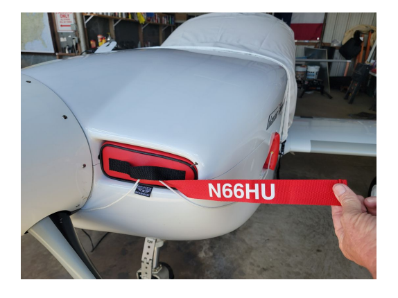
GLASAIR S2-RG Canopy Cover, Engine Plugs