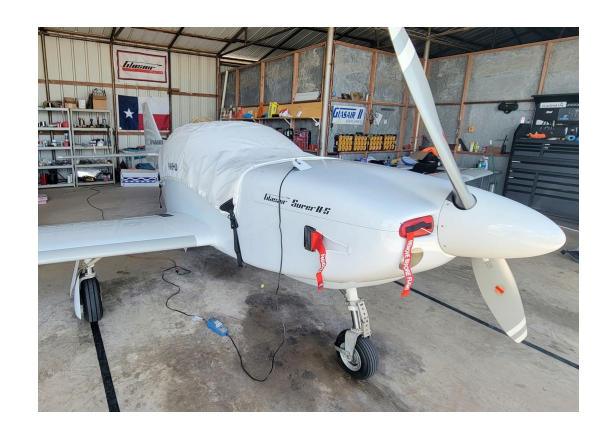
GLASAIR S2-RG Canopy Cover, Engine Plugs