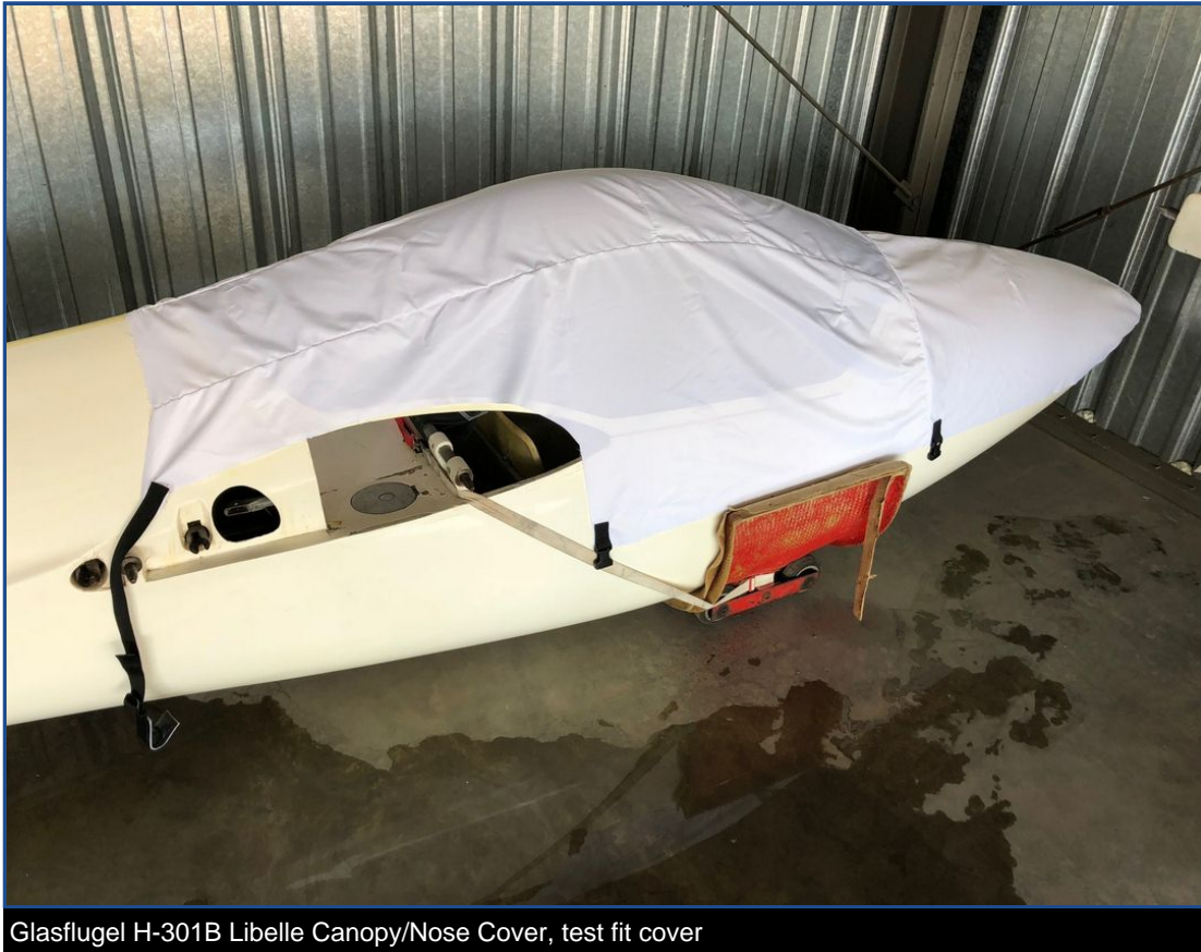
Glasflugel H-301B Libelle Canopy/Nose Cover, test fit cover