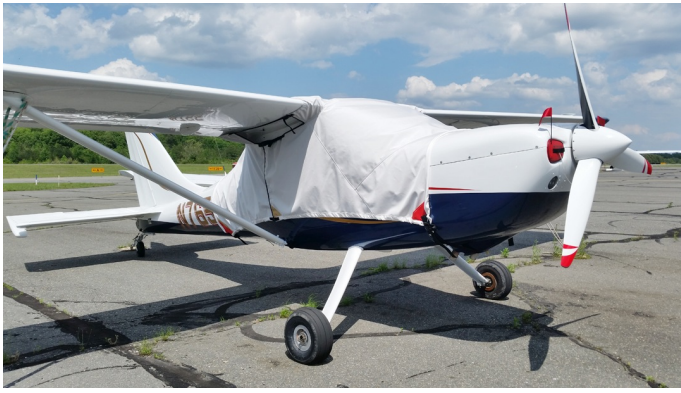
Glastar Over-Top Canopy Cover, Engine Plugs