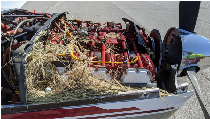
ENGINE PLUGS PREVENT BIRD NEST FOD. Piper Saratoga Engine Cowling Bird's Nest

Engine Inlet Plugs are custom fit for your Glasair Aviation Glastar, Sportsman 2+2 intakes, made with heavy-duty vinyl material, and stuffed with a single block of sculpted urethane foam. Each plug has a zipper that allows the foam to be removed and dried if necessary. Engine plugs have warning flags that are visible from the cockpit or 'remove before flight' streamers sewn onto the face of the plugs. Most plugs are imprinted with the aircraft registration number in black for an extra charge. Storage bag NOT included. Engine plugs may be inserted after flight when the engine is still warm. Engine Inlet Plugs are commonly referred to as Cowl Plugs, Intake Plugs, Cowl Blocks, Engine Blocks, and Engine Bunges.