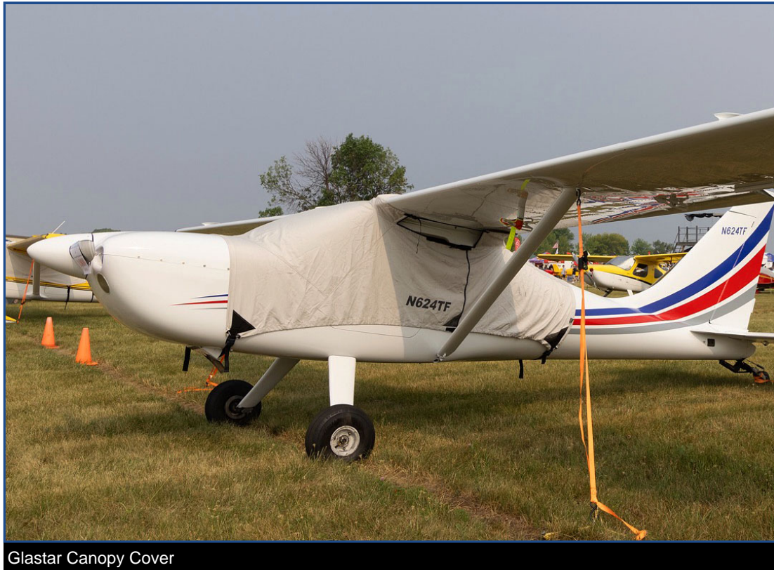
Glastar Canopy Cover