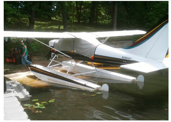
Glastar Sportsman Canopy Cover