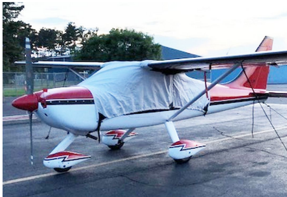
Glasair Aviation Glastar, Sportsman 2+2 Canopy Cover (Over-The-Top Style)

This cover type is made from Silver Acrylic Sunbrella canvas and is 100% lined with a soft and smooth microfiber. Bruce's Custom Covers developed this material combination especially for aircraft protection. The outer material is medium weight and treated for water resistance, UV resistance and anti-static buildup. The inner lining is a very soft and smooth microfiber to prevent scratching. The material is very reflective, and tests show that the cabin interior temperature can be reduced to near-ambient temperature on the hottest of days. It is water, ice and snow repellent, yet breathable to allow moisture to escape from between the cover and the aircraft surface.