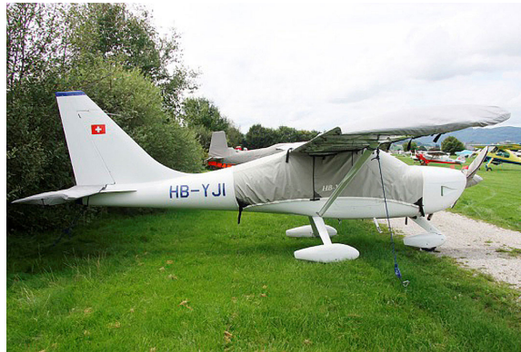
Glastar Canopy, Wings, Horizontal Stab. & Prop Covers

WINTER USE MATERIAL - Made with Solution-Dyed Polyester fabric, this option is intended for seasonal use to aid in deicing, rain mitigation, or for occasional travel. The material is lighter and more compact, but more susceptible to UV damage and may have a shorter useful life if used continuously outside than the all-year use material.