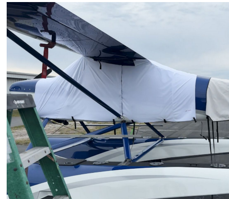
Glasair Sportsman Extended Over-Top Canopy Cover, test fit cover