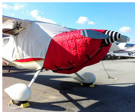
Glastar Insulated Engine Cover