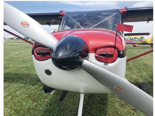
Glastar Engine Plugs