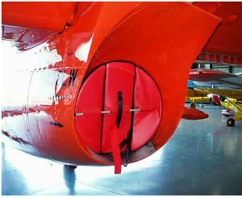
Exhaust Plug, folding type