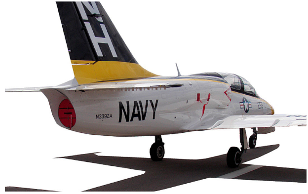
L-39 Exhaust Plug