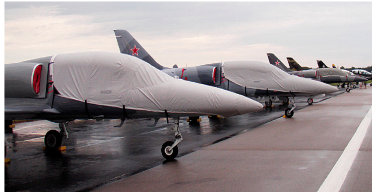
L-39 Canopy/Nose Covers & Plugs