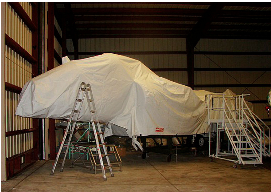
GR-7/9 FULL FUSELAGE COVER , NSN's: 1730-01-600-4557 & 1730-01-600-6757, dual seat