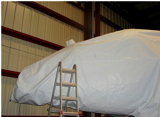
GR-7/9 FULL FUSELAGE COVER , NSN's: 1730-01-600-4557 & 1730-01-600-6757, dual seat