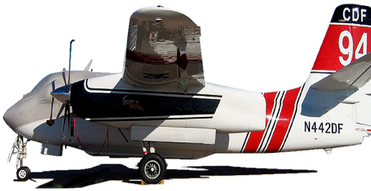
Grumman Tracker (turbine model) Canopy/Nose Cover