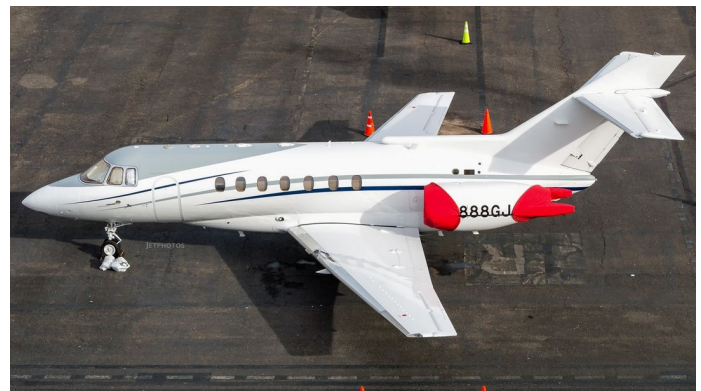
Hawker 1000 Engine Covers