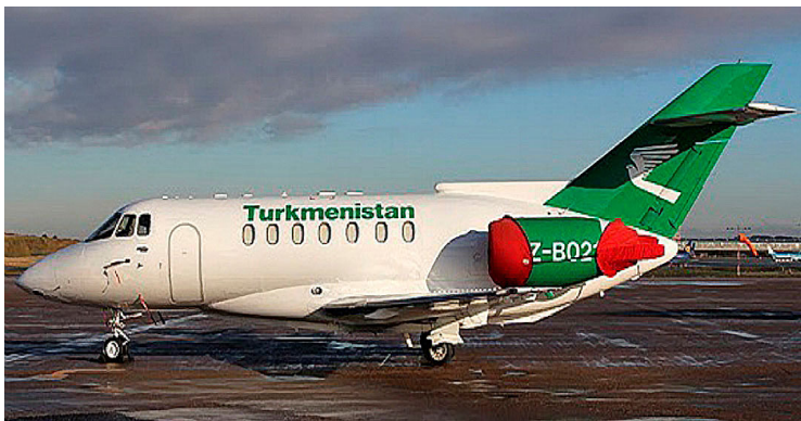
Hawker 1000 Engine Cover Set

The Hawker Beechcraft 1000 Intake Covers are designed to install easily yet be completely storable. A spring steel hoop is sewn into the hem of each cover, allowing them to be installed without climbing onto the wing or using a stepladder. To store the covers the spring steel hoop folds like a band-saw blade into three nesting rings. Each cover folds into a compact circular bundle which is stored in the included duffle bag, yet they unfold quickly for use. The Tri-Fold Ring cover is made of medium weight nylon which is available in a variety of colors to match the paint trim. Each cover set comes complete with installation and folding instructions. The aircraft's registration number can be silkscreened onto the cover for an extra charge.