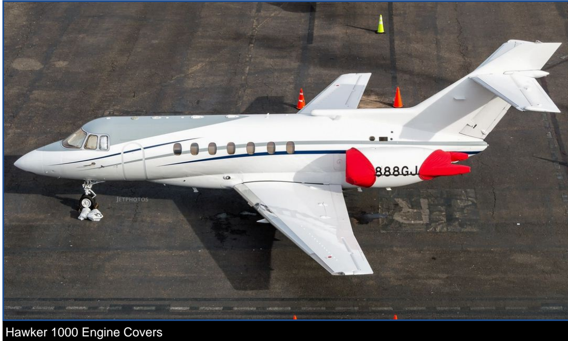
Hawker 1000 Engine Covers