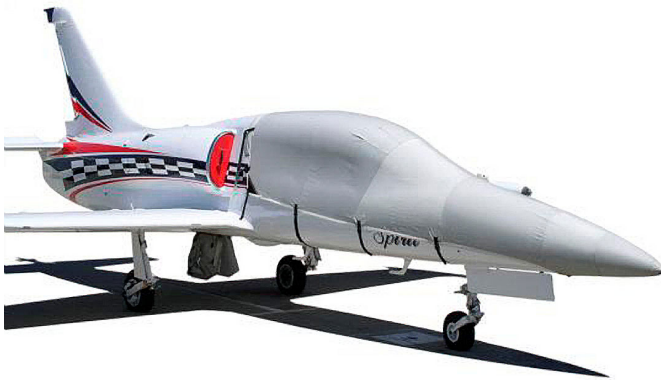
L39 Canopy/Nose Cover & Intake Plugs

This cover type is made from Silver Acrylic Sunbrella canvas and is 100% lined with a soft and smooth microfiber. Bruce's Custom Covers developed this material combination especially for aircraft protection. The outer material is medium weight and treated for water resistance, UV resistance and anti-static buildup. The inner lining is a very soft and smooth microfiber to prevent scratching. The material is very reflective, and tests show that the cabin interior temperature can be reduced to near-ambient temperature on the hottest of days. It is water, ice and snow repellent, yet breathable to allow moisture to escape from between the cover and the aircraft surface.