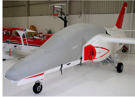
S-211 Canopy/Nose Cover & Engine Plugs