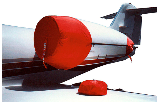
Lear 35 Engine Covers