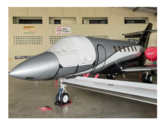
Hawker Beechcraft 750, 800, 800XP, 850XP Cockpit Cover