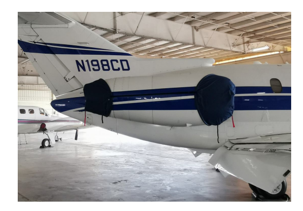
Hawker 750 Engine Covers

Cockpit Heatshields are interior sunshades for the aircraft's cockpit. The product is a unique composite of closed-cell foam with a silver mylar finish. The semi-rigid design is stiff enough to stand inside the window framing. The set folds up flat and is easily stored in the included storage sleeve. Some designs may require velcro and suction cups. Our Heatshields for jets are offered white side out because some aircraft manufacturers have issued advisories against reflective window inserts due to potential heat damage. A Heatshield is an excellent short-term remedy for cockpit overheating, but an external fabric cover is more effective for long-term protection.