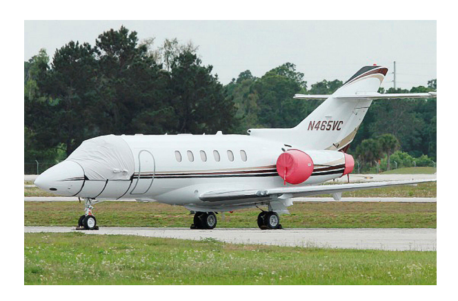
Hawker 800 Cockpit Cover and Engine Covers set