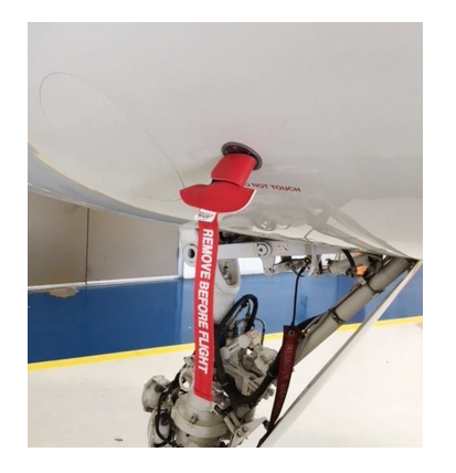
Hawker Beechcraft 800, 800XP, 850XP Pitot Covers With Aoa Straps