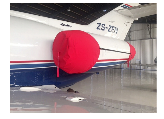
Hawker 800XP Engine Covers, Cockpit HeatShields, Pitot Covers with Hawker Beechcraft 800, 800XP, 850XP Engine Covers AOA straps