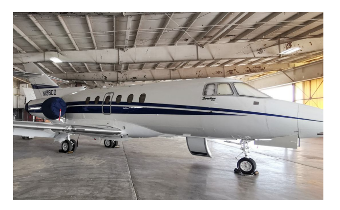
Hawker 750 HeatShields & Engine Covers