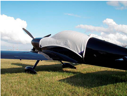
Harmon Rocket Canopy Cover