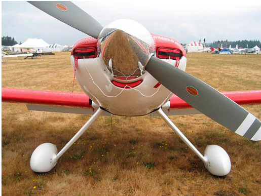
Harmon Rocket Engine Inlet Plugs