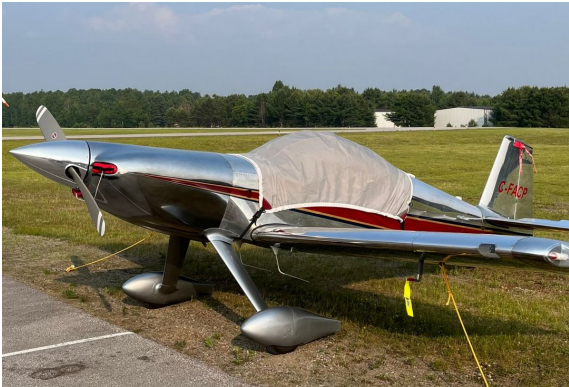
Harmon Rocket Travel Light Weight Canopy Cover Std Windshield

Engine Inlet Plugs are custom fit for your Harmon Rocket intakes, made with heavy-duty vinyl material, and stuffed with a single block of sculpted urethane foam. Each plug has a zipper that allows the foam to be removed and dried if necessary. Engine plugs have warning flags that are visible from the cockpit or 'remove before flight' streamers sewn onto the face of the plugs. Most plugs are imprinted with the aircraft registration number in black for an extra charge. Storage bag NOT included. Engine plugs may be inserted after flight when the engine is still warm. Engine Inlet Plugs are commonly referred to as Cowl Plugs, Intake Plugs, Cowl Blocks, Engine Blocks, and Engine Bungs.