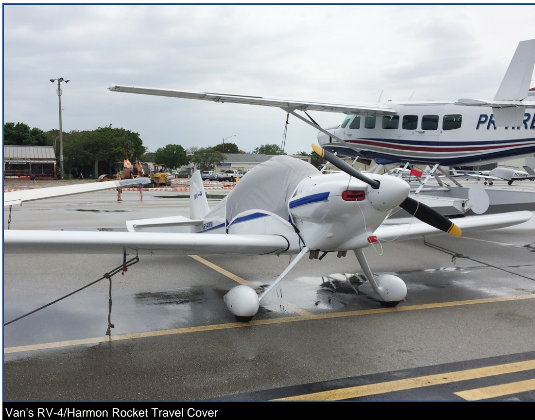
Van's RV-4/Harmon Rocket Travel Cover