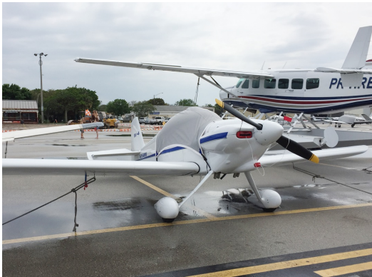
Van's RV-4/Harmon Rocket Travel Cover