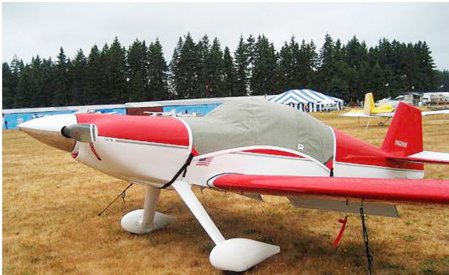
Harmon Rocket Canopy Cover & Engine Inlet Plugs