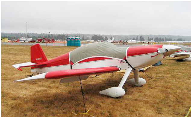
Harmon Rocket Canopy Cover & Engine Inlet Plugs

Travel Covers are made with Silver Solution-Dyed Polyester fabric and only lined over the windshield to save weight. The material is lightweight and more compact for easy stowage in the aircraft. The polyester material is water resistant, but only intended for occasional use outside. We also have an ultra lightweight material available for fitted hangar dust covers. For daily outdoor use, the non-travel Sunbrella Cover is the best choice.