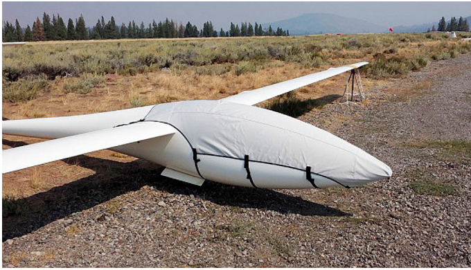
ASW-20C Canopy/Nose Cover

the hottest of days. It is water, ice and snow repellent, yet breathable to allow moisture to escape from between the cover and the aircraft surface.