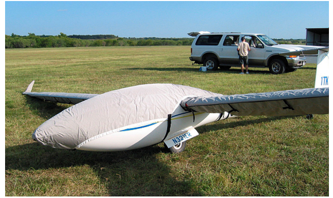
Canopy/Nose Cover, Wings and Horizontal Stab Covers