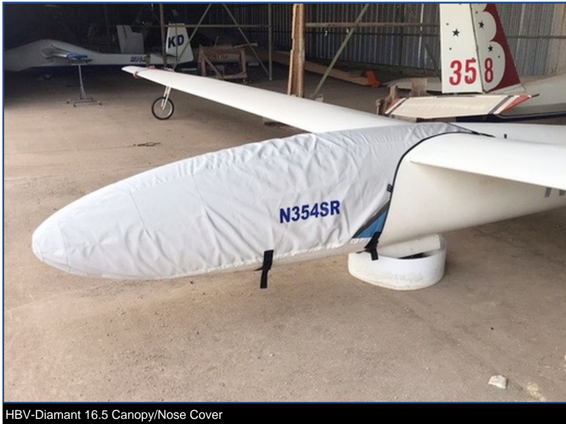
HBV-Diamant 16.5 Canopy/Nose Cover