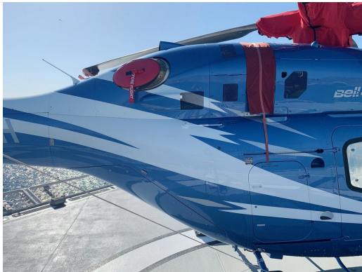
Bell 429 Exhaust Plug, Rotor Mast Cover

The Engine Exhaust Plugs are custom fit for your Eagle R&D Helicycle exhaust openings, made with heavy-duty vinyl material, and stuffed with a single block of sculpted urethane foam. Exhaust plugs have 'Remove Before Flight' streamers sewn onto the face of the plugs. Exhaust plugs may be inserted soon after flight when the engine is still warm. Engine Inlet Plugs are commonly referred to as Cowl Plugs, Intake Plugs, Cowl Blocks, Engine Blocks, and Engine Bungs.