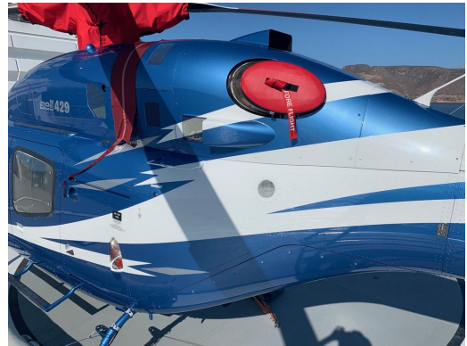
Bell 429 Exhaust Plug