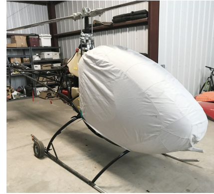
Helicycle Bubble Cover