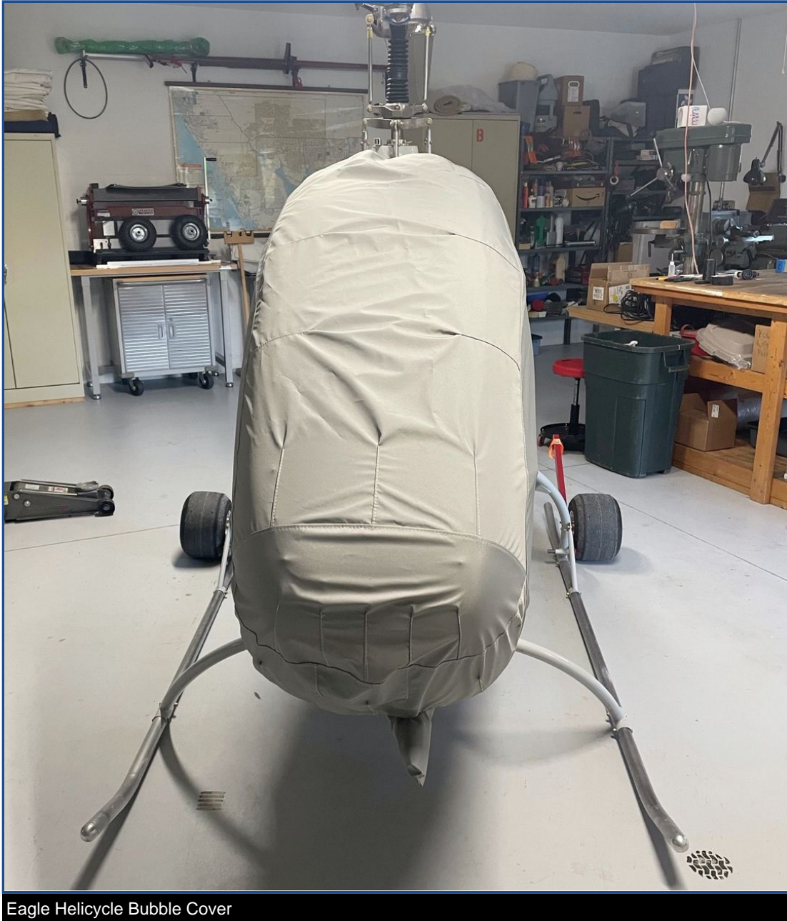
Eagle Helicycle Bubble Cover