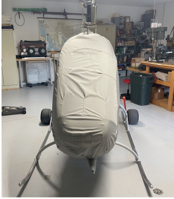
Eagle Helicycle Bubble Cover

and more compact for easy stowage in the aircraft. The polyester material is water resistant, but only intended for occasional use outside. We also have an ultra lightweight material available for fitted hangar dust covers. For daily outdoor use, the non-travel Sunbrella Cover is the best choice.