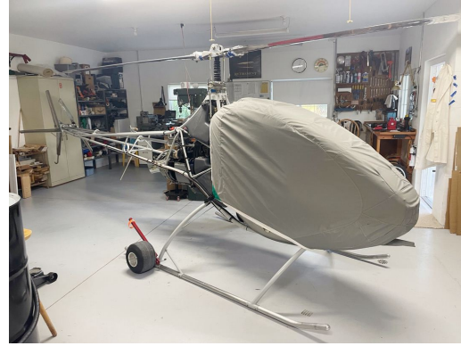
Eagle Helicycle Bubble Cover