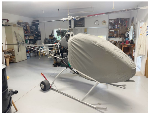
Eagle Helicycle Bubble Cover