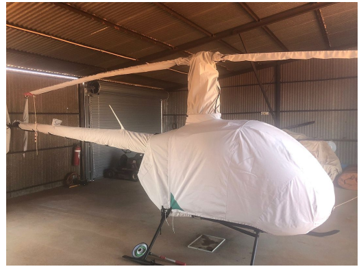
Robinson R-22 Full Cover Set