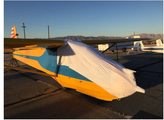
Sailplane Full Cover Set Graphic Indicators (Discus 2B, 3D model) Schweizer SGU 2-22EK Canopy/Nose Cover, test fit cover