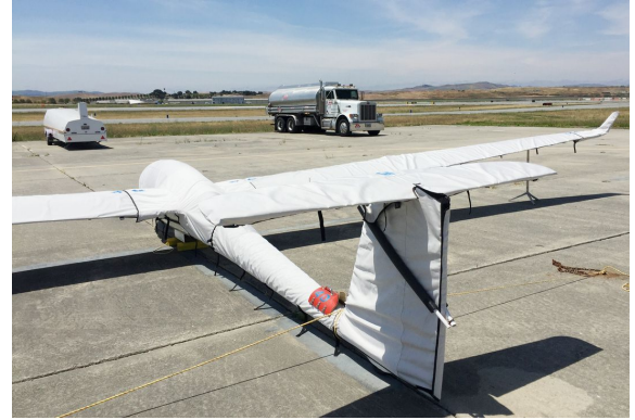
Schempp-Hirth Discus 2B Full Cover Set