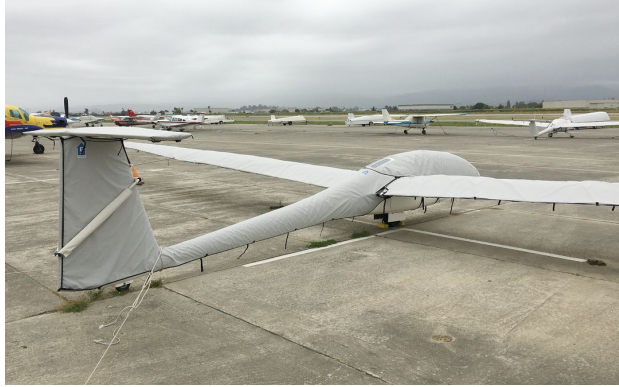
DG-505 Canopy/Nose, Wing, Empennage & Horiz. Stab. Covers

WINTER USE MATERIAL - Made with Solution-Dyed Polyester fabric, this option is intended for seasonal use to aid in deicing, rain mitigation, or for occasional travel. The material is lighter and more compact, but more susceptible to UV damage and may have a shorter useful life if used continuously outside than the all-year use material.