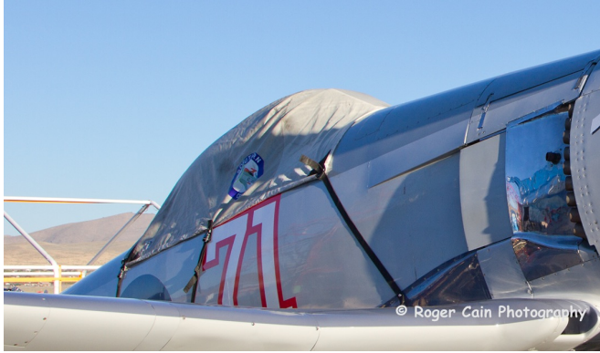
Hawker Sea Fury Canopy Cover

This cover type is made from Silver Acrylic Sunbrella canvas and is 100% lined with a soft and smooth microfiber. Bruce's Custom Covers developed this material combination especially for aircraft protection. The outer material is medium weight and treated for water resistance, UV resistance and anti-static buildup. The inner lining is a very soft and smooth microfiber to prevent scratching. The material is very reflective, and tests show that the cabin interior temperature can be reduced to near-ambient temperature on the hottest of days. It is water, ice and snow repellent, yet breathable to allow moisture to escape from between the cover and the aircraft surface.