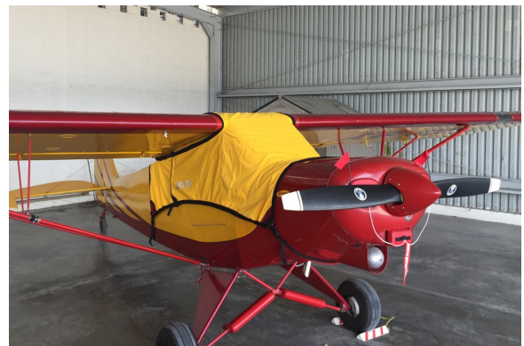
Piper Super Cub Canopy Cover, Engine Plugs