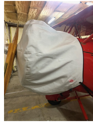
Hatz Biplane CB-1 Engine Cover