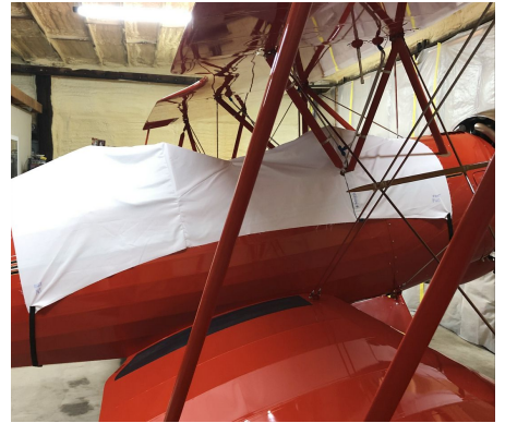
Hatz Biplane Canopy Cover, test fit cover