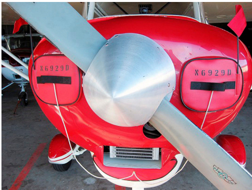
Piper PA-22-150 Engine Inlet Plugs (set of 3)

Engine Inlet Plugs are custom fit for your Hatz Biplane CB-1 intakes, made with heavy-duty vinyl material, and stuffed with a single block of sculpted urethane foam. Each plug has a zipper that allows the foam to be removed and dried if necessary. Engine plugs have warning flags that are visible from the cockpit or 'remove before flight' streamers sewn onto the face of the plugs. Most plugs are imprinted with the aircraft registration number in black for an extra charge. Storage bag NOT included. Engine plugs may be inserted after flight when the engine is still warm. Engine Inlet Plugs are commonly referred to as Cowl Plugs, Intake Plugs, Cowl Blocks, Engine Blocks, and Engine Bungs.