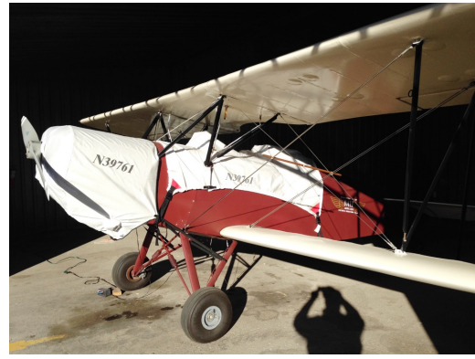
Hatz Biplane Canopy and Engine Covers