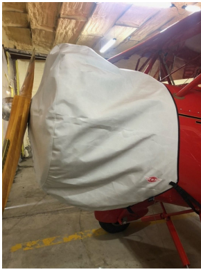
Hatz Biplane CB-1 Engine Cover