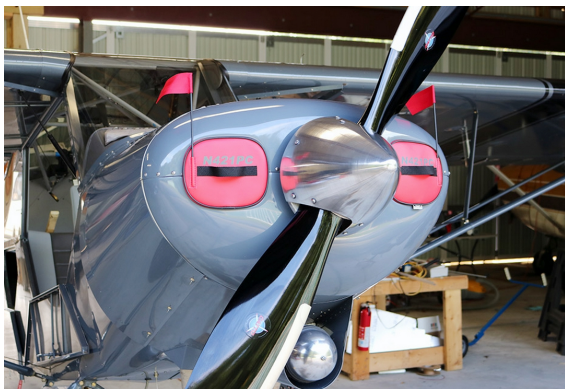
Piper PA-18 Super Cub Engine Inlet Plugs

Engine Inlet Plugs are custom fit for your Hatz Biplane CB-1 intakes, made with heavy-duty vinyl material, and stuffed with a single block of sculpted urethane foam. Each plug has a zipper that allows the foam to be removed and dried if necessary. Engine plugs have warning flags that are visible from the cockpit or 'remove before flight' streamers sewn onto the face of the plugs. Most plugs are imprinted with the aircraft registration number in black for an extra charge. Storage bag NOT included. Engine plugs may be inserted after flight when the engine is still warm. Engine Inlet Plugs are commonly referred to as Cowl Plugs, Intake Plugs, Cowl Blocks, Engine Blocks, and Engine Bungs.