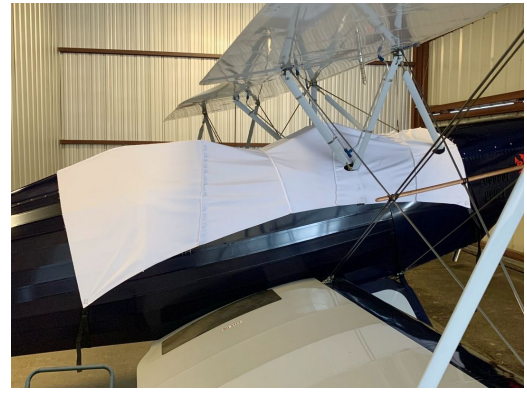
Hatz Biplane Canopy Cover, test fit cover