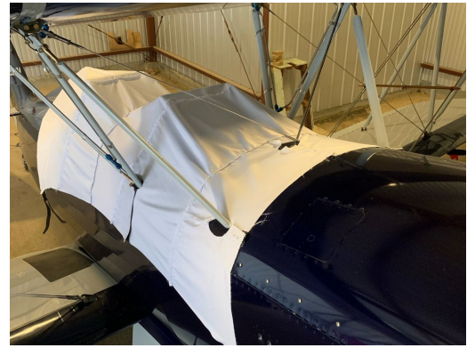
Hatz Biplane Canopy Cover, test fit cover