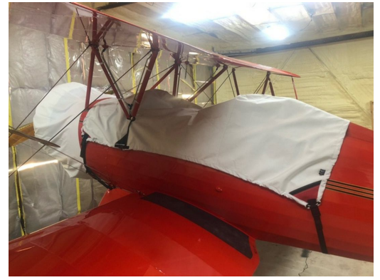
Hatz Biplane CB-1 Canopy Cover & Engine Cover