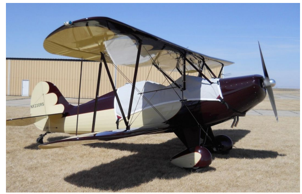
Hatz Biplane Canopy Cover