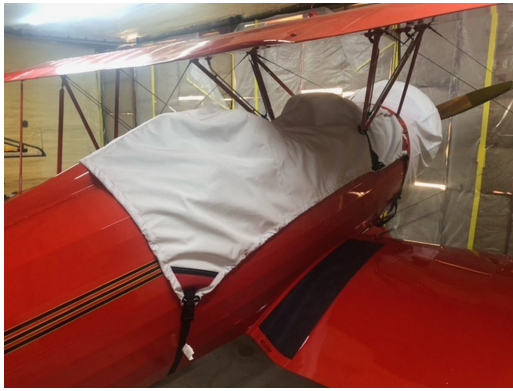
Hatz CB-1 Biplane Canopy & Engine Covers