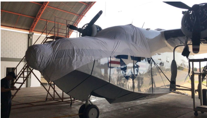
Grumman HU-16 Albatross Cockpit/Nose Cover (test fit cover)

This cover type is made from Silver Acrylic Sunbrella canvas and is 100% lined with a soft and smooth microfiber. Bruce's Custom Covers developed this material combination especially for aircraft protection. The outer material is medium weight and treated for water resistance, UV resistance and anti-static buildup. The inner lining is a very soft and smooth microfiber to prevent scratching. The material is very reflective, and tests show that the cabin interior temperature can be reduced to near-ambient temperature on the hottest of days. It is water, ice and snow repellent, yet breathable to allow moisture to escape from between the cover and the aircraft surface.