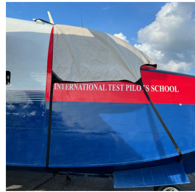
Grumman Albatross Cockpit Cover