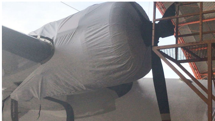
Grumman HU-16 Albatross Engine Cover (test fit cover)

This cover type is made from Silver Acrylic Sunbrella canvas and is 100% lined with a soft and smooth microfiber. Bruce's Custom Covers developed this material combination especially for aircraft protection. The outer material is medium weight and treated for water resistance, UV resistance and anti-static buildup. The inner lining is a very soft and smooth microfiber to prevent scratching. The material is very reflective, and tests show that the cabin interior temperature can be reduced to near-ambient temperature on the hottest of days. It is water, ice and snow repellent, yet breathable to allow moisture to escape from between the cover and the aircraft surface.