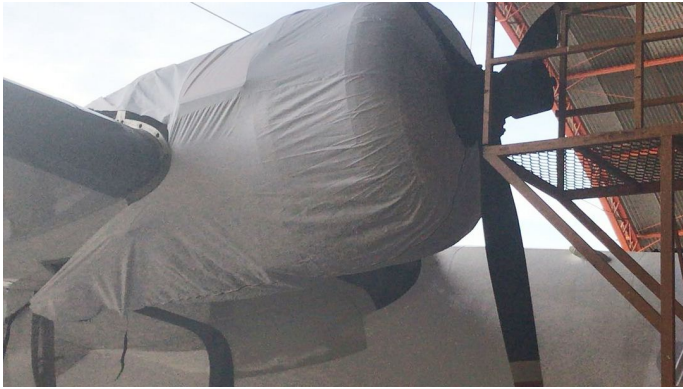
Grumman HU-16 Albatross Engine Cover (test fit cover)

This cover type is made from Silver Acrylic Sunbrella canvas and is 100% lined with a soft and smooth microfiber. Bruce's Custom Covers developed this material combination especially for aircraft protection. The outer material is medium weight and treated for water resistance, UV resistance and anti-static buildup. The inner lining is a very soft and smooth microfiber to prevent scratching. The material is very reflective, and tests show that the cabin interior temperature can be reduced to near-ambient temperature on the hottest of days. It is water, ice and snow repellent, yet breathable to allow moisture to escape from between the cover and the aircraft surface.