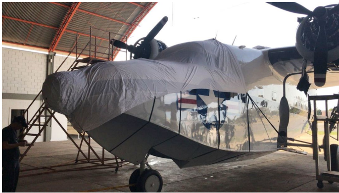
Grumman HU-16 Albatross Cockpit/Nose Cover (test fit cover)

This cover type is made from Silver Acrylic Sunbrella canvas and is 100% lined with a soft and smooth microfiber. Bruce's Custom Covers developed this material combination especially for aircraft protection. The outer material is medium weight and treated for water resistance, UV resistance and anti-static buildup. The inner lining is a very soft and smooth microfiber to prevent scratching. The material is very reflective, and tests show that the cabin interior temperature can be reduced to near-ambient temperature on the hottest of days. It is water, ice and snow repellent, yet breathable to allow moisture to escape from between the cover and the aircraft surface.