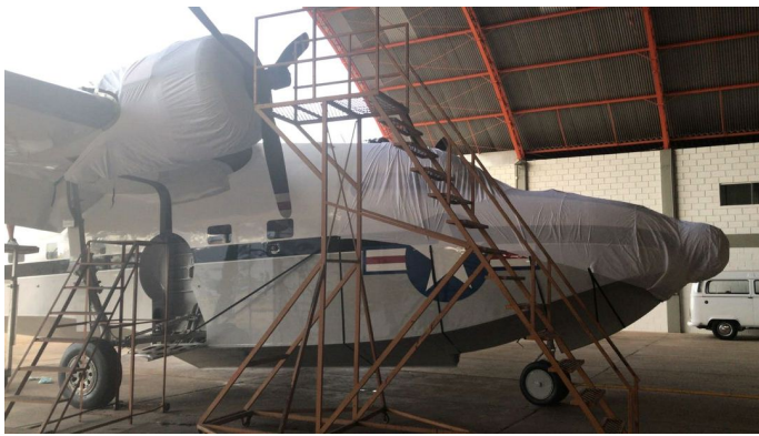
Grumman HU-16 Albatross Cockpit/Nose Cover and Engine Cover(test fit covers)

This cover type is made from Silver Acrylic Sunbrella canvas and is 100% lined with a soft and smooth microfiber. Bruce's Custom Covers developed this material combination especially for aircraft protection. The outer material is medium weight and treated for water resistance, UV resistance and anti-static buildup. The inner lining is a very soft and smooth microfiber to prevent scratching. The material is very reflective, and tests show that the cabin interior temperature can be reduced to near-ambient temperature on the hottest of days. It is water, ice and snow repellent, yet breathable to allow moisture to escape from between the cover and the aircraft surface.