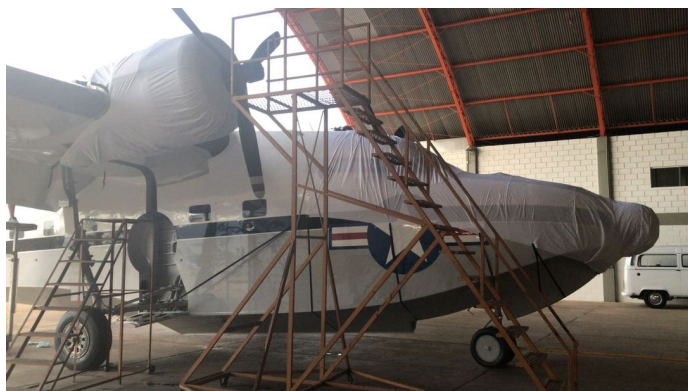
Grumman HU-16 Albatross Cockpit/Nose Cover and Engine Cover(test fit covers)

This cover type is made from Silver Acrylic Sunbrella canvas and is 100% lined with a soft and smooth microfiber. Bruce's Custom Covers developed this material combination especially for aircraft protection. The outer material is medium weight and treated for water resistance, UV resistance and anti-static buildup. The inner lining is a very soft and smooth microfiber to prevent scratching. The material is very reflective, and tests show that the cabin interior temperature can be reduced to near-ambient temperature on the hottest of days. It is water, ice and snow repellent, yet breathable to allow moisture to escape from between the cover and the aircraft surface.