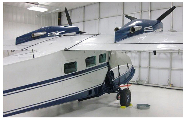
Grumman G44 Widgeon Cockpit/Nose Cover