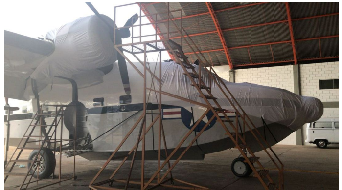
Grumman HU-16 Albatross Cockpit/Nose Cover and Engine Cover(test fit covers)