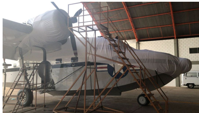
Grumman Albatross Cockpit Cover