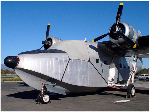
Canopy Cover for the Grumman HU-16 Albatross

This cover type is made from Silver Acrylic Sunbrella canvas and is 100% lined with a soft and smooth microfiber. Bruce's Custom Covers developed this material combination especially for aircraft protection. The outer material is medium weight and treated for water resistance, UV resistance and anti-static buildup. The inner lining is a very soft and smooth microfiber to prevent scratching. The material is very reflective, and tests show that the cabin interior temperature can be reduced to near-ambient temperature on the hottest of days. It is water, ice and snow repellent, yet breathable to allow moisture to escape from between the cover and the aircraft surface.