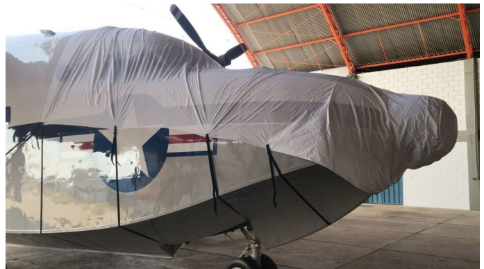
Grumman HU-16 Albatross Cockpit/Nose Cover (test fit cover)