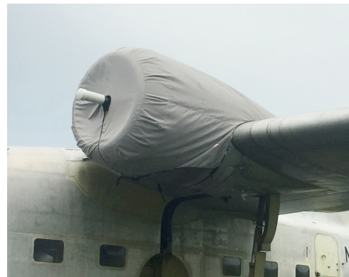
Grumman Albatross Engine Covers