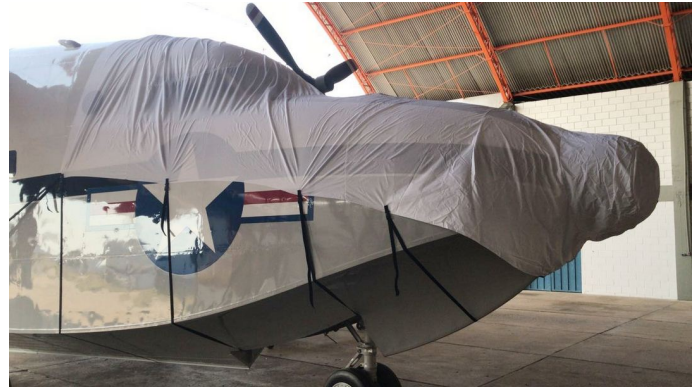
Grumman HU-16 Albatross Cockpit/Nose Cover (test fit cover)