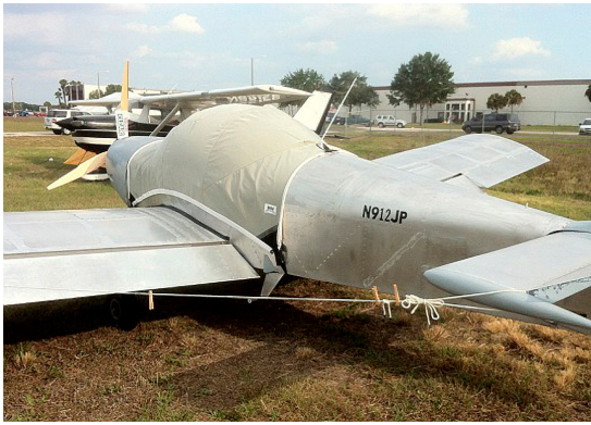
Zenith 601 XL Canopy Cover