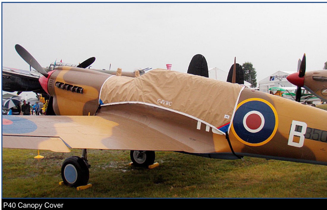
P40 Canopy Cover