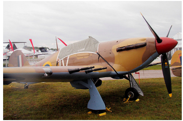
Hawker Hurricane Canopy Cover