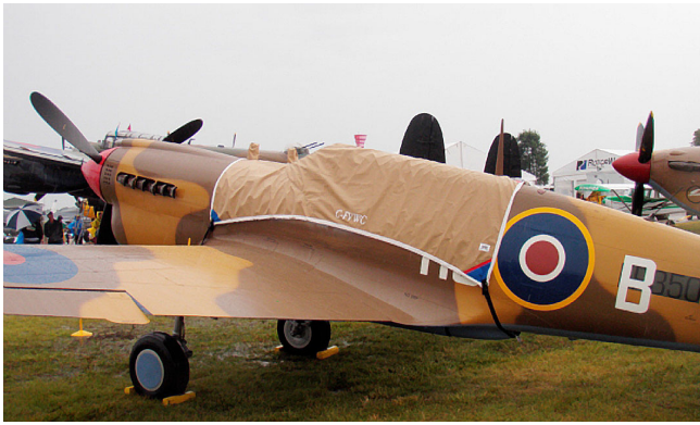
P40 Canopy Cover