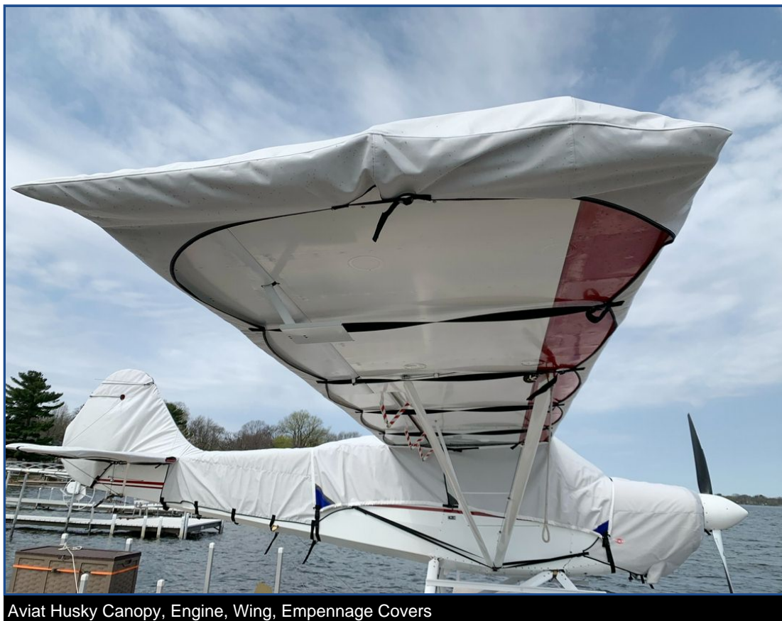
Aviat Husky Canopy, Engine, Wing, Empennage Covers