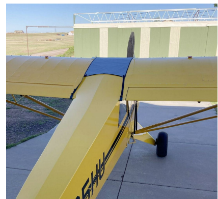
Aviat Husky Windshield/Skylight Cover