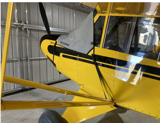
Aviat Husky Windshield/Skylight Cover

This cover type is made from Silver Acrylic Sunbrella canvas and is 100% lined with a soft and smooth microfiber. Bruce's Custom Covers developed this material combination especially for aircraft protection. The outer material is medium weight and treated for water resistance, UV resistance and anti-static buildup. The inner lining is a very soft and smooth microfiber to prevent scratching. The material is very reflective, and tests show that the cabin interior temperature can be reduced to near-ambient temperature on the hottest of days. It is water, ice and snow repellent, yet breathable to allow moisture to escape from between the cover and the aircraft surface.