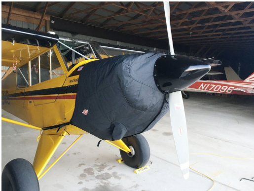
Aviat Husky Insulated Engine Cover

This cover type is made from Silver Acrylic Sunbrella canvas and is 100% lined with a soft and smooth microfiber. Bruce's Custom Covers developed this material combination especially for aircraft protection. The outer material is medium weight and treated for water resistance, UV resistance and anti-static buildup. The inner lining is a very soft and smooth microfiber to prevent scratching. The material is very reflective, and tests show that the cabin interior temperature can be reduced to near-ambient temperature on the hottest of days. It is water, ice and snow repellent, yet breathable to allow moisture to escape from between the cover and the aircraft surface.