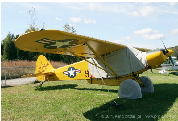
Piper L-21b Extended Canopy Cover, Tire Covers