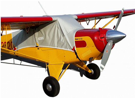
Aviat Husky Canopy Cover & Engine Plugs