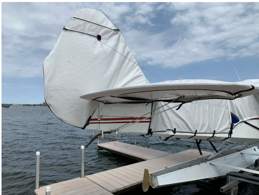
Aviat Husky Empennage Cover