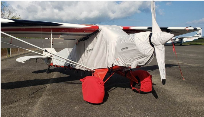
Aviat Husky Extended Canopy Cover, Engine, Prop, Empennage & Tire Covers

This cover type is made from Silver Acrylic Sunbrella canvas and is 100% lined with a soft and smooth microfiber. Bruce's Custom Covers developed this material combination especially for aircraft protection. The outer material is medium weight and treated for water resistance, UV resistance and anti-static buildup. The inner lining is a very soft and smooth microfiber to prevent scratching. The material is very reflective, and tests show that the cabin interior temperature can be reduced to near-ambient temperature on the hottest of days. It is water, ice and snow repellent, yet breathable to allow moisture to escape from between the cover and the aircraft surface.