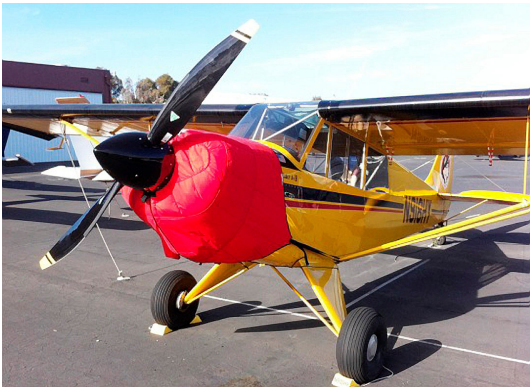
Aviat Husky Insulated Engine Cover