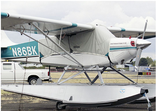
Aviat Husky Canopy Cover and Inlet Plugs

Engine Inlet Plugs are custom fit for your Aviat (Christen) Husky intakes, made with heavy-duty vinyl material, and stuffed with a single block of sculpted urethane foam. Each plug has a zipper that allows the foam to be removed and dried if necessary. Engine plugs have warning flags that are visible from the cockpit or 'remove before flight' streamers sewn onto the face of the plugs. Most plugs are imprinted with the aircraft registration number in black for an extra charge. Storage bag NOT included. Engine plugs may be inserted after flight when the engine is still warm. Engine Inlet Plugs are commonly referred to as Cowl Plugs, Intake Plugs, Cowl Blocks, Engine Blocks, and Engine Bungs.