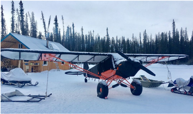
Piper PA-18 Super Cub Canopy Cover (Over-The-Top Style)