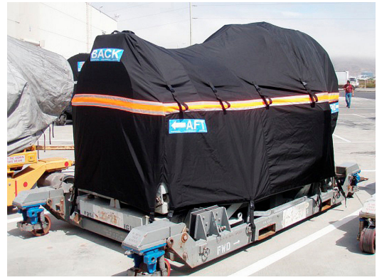
IAE V2500 QEC OFF-LINK JET ENGINE COVER, "rain cap" style