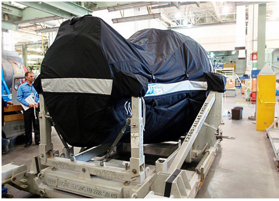
QEC OFF-LINK JET ENGINE COVER, V2500 Series, fully enclosed