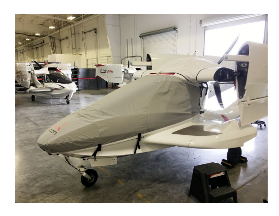
Icon A5 Travel Weight Canopy/Nose Cover, Engine Cover