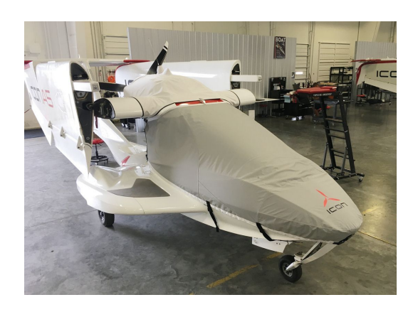
Icon A5 Travel Weight Canopy/Nose Cover, Engine Cover