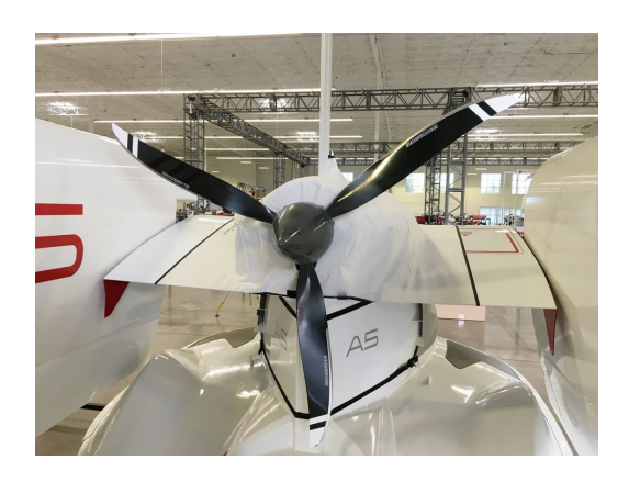
Icon A5 Engine Cover