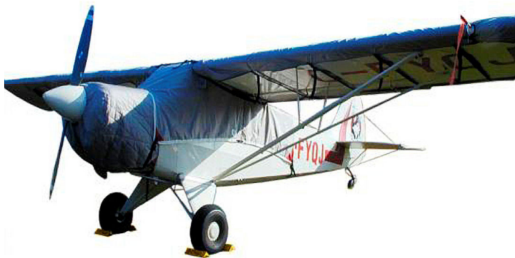
Aviat Husky Insulated Engine Cover, Canopy & Wing Covers

This cover type is made from Silver Acrylic Sunbrella canvas and is 100% lined with a soft and smooth microfiber. Bruce's Custom Covers developed this material combination especially for aircraft protection. The outer material is medium weight and treated for water resistance, UV resistance and anti-static buildup. The inner lining is a very soft and smooth microfiber to prevent scratching. The material is very reflective, and tests show that the cabin interior temperature can be reduced to near-ambient temperature on the hottest of days. It is water, ice and snow repellent, yet breathable to allow moisture to escape from between the cover and the aircraft surface.