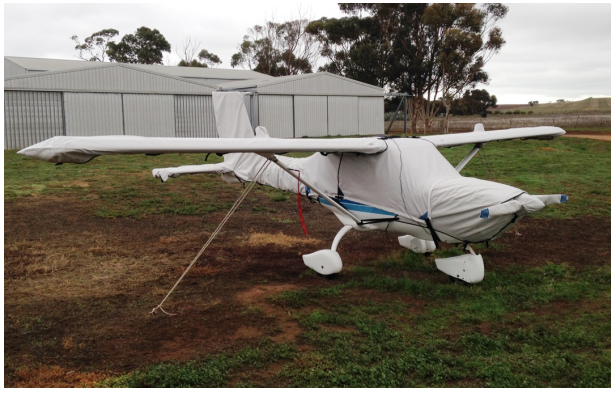
Jabiru 160 Canopy, Engine, Prop, Wings & Empennage Covers