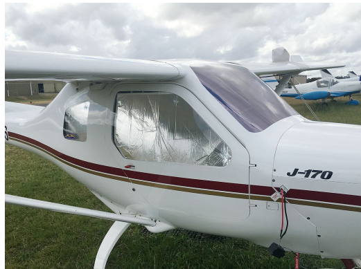
Jabiru 170 Heatshield Set

Heatshields are interior sunshades for an aircraft's windows or canopy glass. The product is a unique composite of closed-cell foam with a silver mylar finish. The semi-rigid design is stiff enough to stand along the inside of the windshield using sun visors or window framing. It folds up flat and easily stores in the included storage sleeve. Some designs may require velcro and suction cups. A Heatshield is an excellent short-term remedy for cockpit overheating.