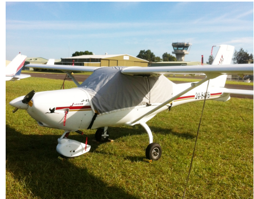
Jabiru 170 Canopy Cover