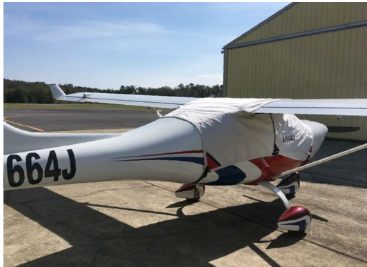
Jabiru J230-SP Canopy Cover, Over-Top Style

This cover type is made from Silver Acrylic Sunbrella canvas and is 100% lined with a soft and smooth microfiber. Bruce's Custom Covers developed this material combination especially for aircraft protection. The outer material is medium weight and treated for water resistance, UV resistance and anti-static buildup. The inner lining is a very soft and smooth microfiber to prevent scratching. The material is very reflective, and tests show that the cabin interior temperature can be reduced to near-ambient temperature on the hottest of days. It is water, ice and snow repellent, yet breathable to allow moisture to escape from between the cover and the aircraft surface.