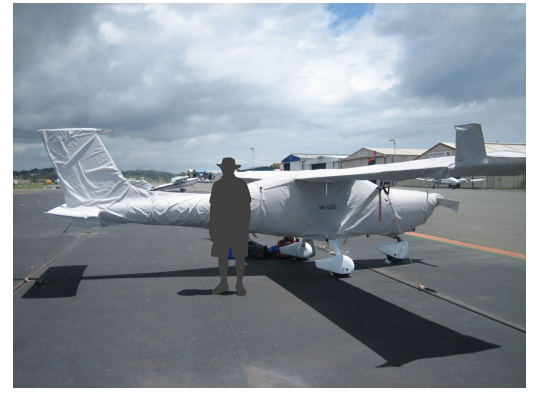
Jabiru J430 Complete Cover Set