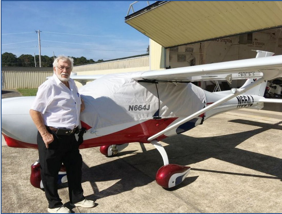
Jabiru 230SP Canopy Cover, Over-Top Style