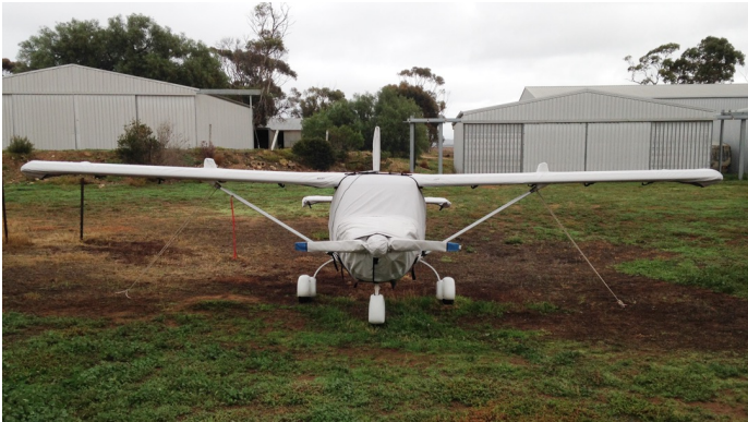
Jabiru 160 Canopy, Engine, Prop, Wings & Empennage Covers Jabiru 160 Canopy, Engine, Prop, Wings & Empennage Covers