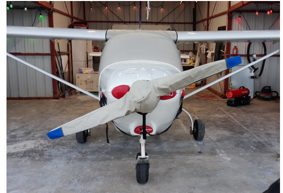
Jabiru J250 Canopy & Prop Cover