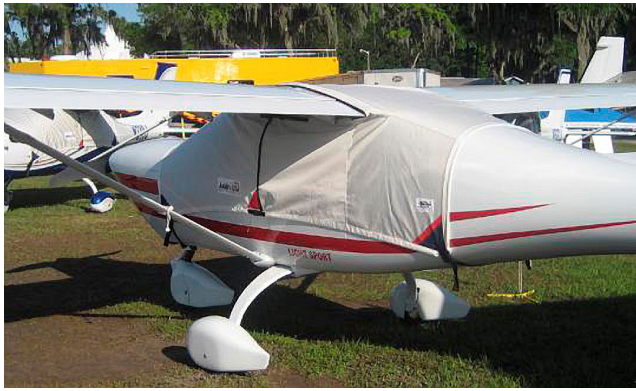
Jabiru 250SP Canopy Cover, Over-top style