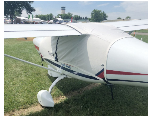
Jabiru J250 Canopy Cover