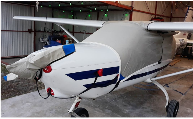
Jabiru J250 Canopy & Prop Cover