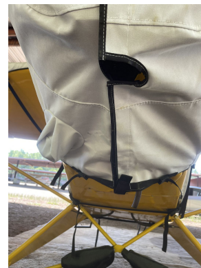
Piper J-3C-65 Cub Engine Cover, Fully Enclosed