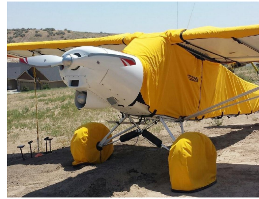
Piper PA-18 Super Cub Extended Canopy Cover, Wing & Tire Covers Piper PA-18 Super Cub Extended Canopy Cover, Wing & Tire Covers