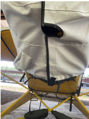
Piper J-3C-65 Cub Engine Cover, Fully Enclosed