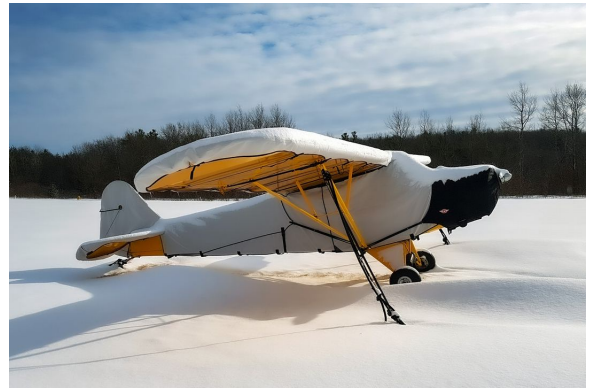
Piper J3 Cub Extended Canopy, Wings, Empennage & Insulated Engine Covers