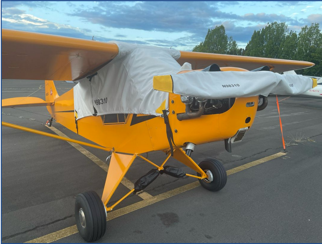
Piper J3 Canopy Cover, Prop Cover