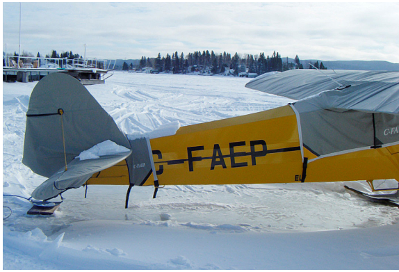
Piper J3 Cub Abbreviated Empennage Cover, Wing Covers and Canopy Cover