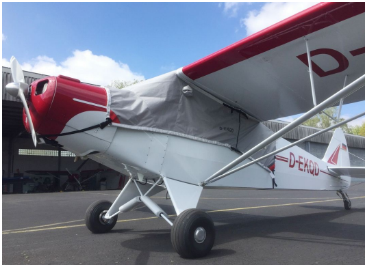
Piper J-3 Cub Travel Cover, Over-The-Top Style Piper Super Cub Travel Weight Canopy Cover