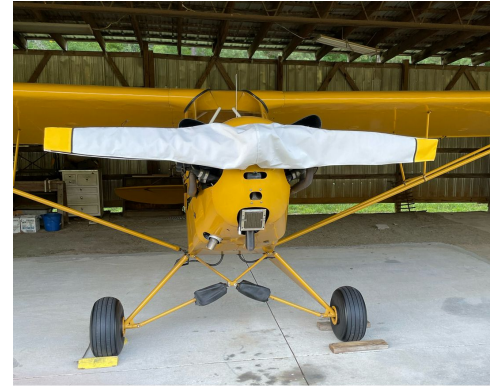
Piper J3 Cub Prop Cover