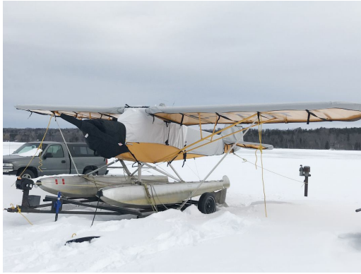
Piper J3 Cub Extended Canopy, Wings, Empennage & Insulated Engine Covers