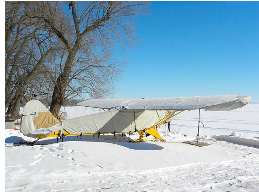
Piper J3 Cub Full Cover Set