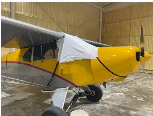
Piper J5A Windshield/Skylight Cover, test fit

This cover type is made from Silver Acrylic Sunbrella canvas and is 100% lined with a soft and smooth microfiber. Bruce's Custom Covers developed this material combination especially for aircraft protection. The outer material is medium weight and treated for water resistance, UV resistance and anti-static buildup. The inner lining is a very soft and smooth microfiber to prevent scratching. The material is very reflective, and tests show that the cabin interior temperature can be reduced to near-ambient temperature on the hottest of days. It is water, ice and snow repellent, yet breathable to allow moisture to escape from between the cover and the aircraft surface.