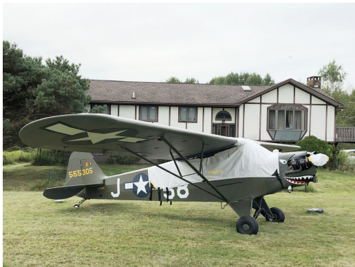
Piper L-4 Over-Top Canopy Cover, Prop Cover

This cover type is made from Silver Acrylic Sunbrella canvas and is 100% lined with a soft and smooth microfiber. Bruce's Custom Covers developed this material combination especially for aircraft protection. The outer material is medium weight and treated for water resistance, UV resistance and anti-static buildup. The inner lining is a very soft and smooth microfiber to prevent scratching. The material is very reflective, and tests show that the cabin interior temperature can be reduced to near-ambient temperature on the hottest of days. It is water, ice and snow repellent, yet breathable to allow moisture to escape from between the cover and the aircraft surface.