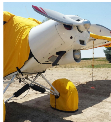
Piper PA-18 Super Cub Extended Canopy Cover, Wing & Tire Covers