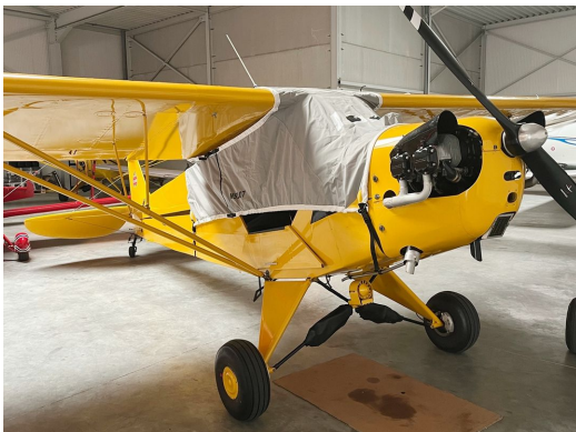
Piper J-3 Cub Travel Cover, Over-The-Top Style

This cover type is made from Silver Acrylic Sunbrella canvas and is 100% lined with a soft and smooth microfiber. Bruce's Custom Covers developed this material combination especially for aircraft protection. The outer material is medium weight and treated for water resistance, UV resistance and anti-static buildup. The inner lining is a very soft and smooth microfiber to prevent scratching. The material is very reflective, and tests show that the cabin interior temperature can be reduced to near-ambient temperature on the hottest of days. It is water, ice and snow repellent, yet breathable to allow moisture to escape from between the cover and the aircraft surface.