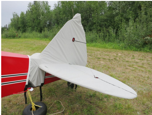
Piper PA-12 Abbreviated Empennage Cover

WINTER USE MATERIAL - Made with Solution-Dyed Polyester fabric, this option is intended for seasonal use to aid in deicing, rain mitigation, or for occasional travel. The material is lighter and more compact, but more susceptible to UV damage and may have a shorter useful life if used continuously outside than the all-year use material.