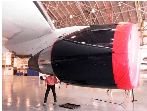
Boeing 767 Intake Covers Ship Set