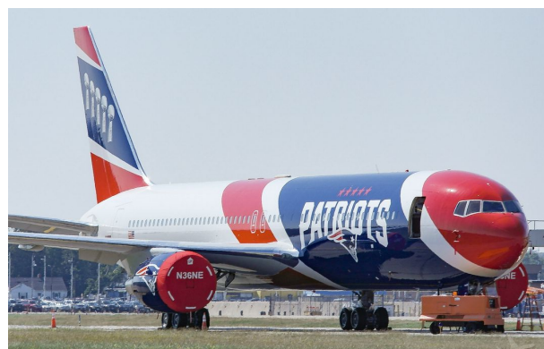
Boeing 767 Intake Covers