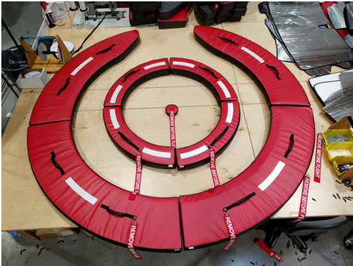
Boeing 747-8 Exhaust Plugs