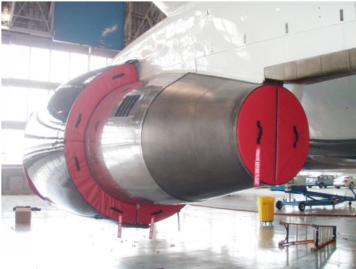
Exhaust Plugs Ship Set, incl. Fan Thrust Reverser and Exhaust Plugs P/N: B767-200

The Engine Inlet Plugs are custom fit for your Boeing KC-46, KC-46A, Pegasus intakes, made with heavy-duty vinyl material, and stuffed with a single block of sculpted urethane foam. Each plug has a zipper that allows the foam to be removed and dried if necessary. Engine plugs have 'remove before flight' streamers sewn onto the face of the plugs. Most plugs are imprinted with the aircraft registration number in black for an extra charge. Storage bag NOT included. Engine plugs may be inserted after flight when the engine is still warm. Engine Inlet Plugs are commonly referred to as Cowl Plugs, Intake Plugs, Cowl Blocks, Engine Blocks, and Engine Bungs.