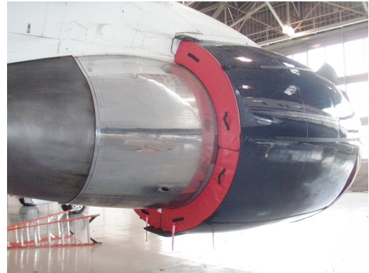
Boeing 767 Exhaust Plugs Ship Set, incl. Fan Thrust Reverser and Exhaust Plugs P/N: B767-200