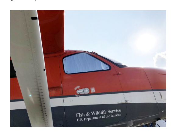
Quest Kodiak Cockpit HeatShields