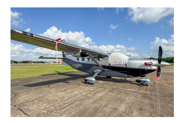
Kodiak 200 Cockpit Cover, Pitot Cover, Prop Tie/Exhaust Cover