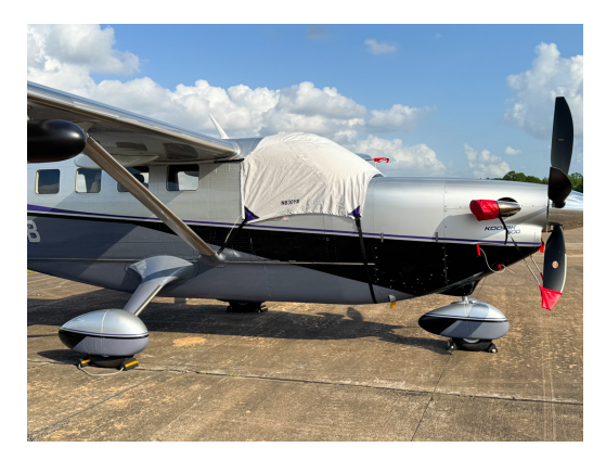
Kodiak Aircraft Co Inc KODIAK 200 Cockpit Cover