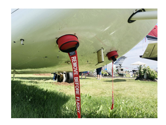
Quest Kodiak Lower Cowling Bypass Duct Plugs