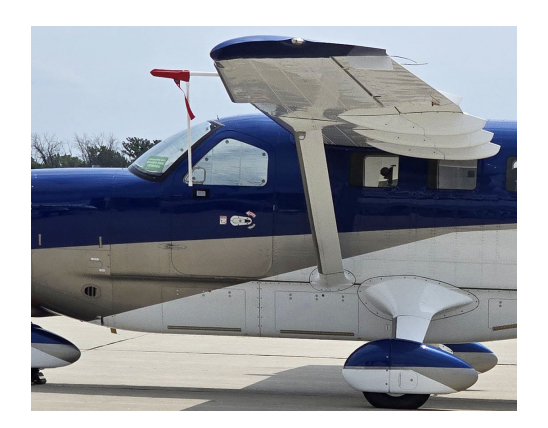
Quest Aircraft Kodiak Cockpit Heatshields

Cockpit Heatshields are interior sunshades for the aircraft's cockpit. The product is a unique composite of closed-cell foam with a silver mylar finish. The semi-rigid design is stiff enough to stand inside the window framing. The set folds up flat and is easily stored in the included storage sleeve. Some designs may require velcro and suction cups. A Heatshield is an excellent short-term remedy for cockpit overheating, but an external fabric cover is more effective for long-term protection.