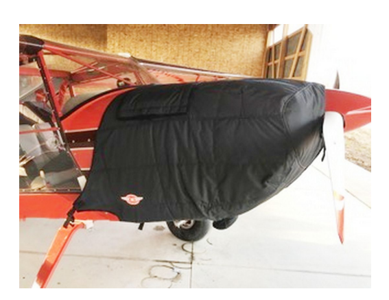
Kitfox Insulated Engine Cover