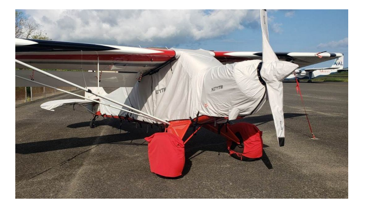
Aviat Husky Extended Canopy Cover, Engine, Prop, Empennage & Tire Covers