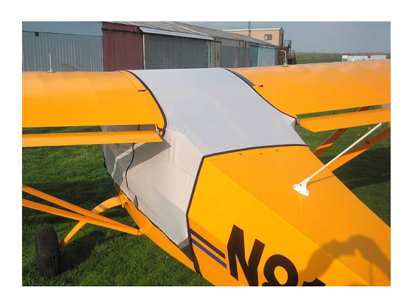
Aerotrek A240 Spandex FlyAway Travel Canopy Cover