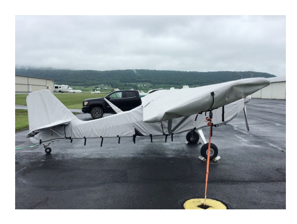
Skystar Kitfox Cover Set