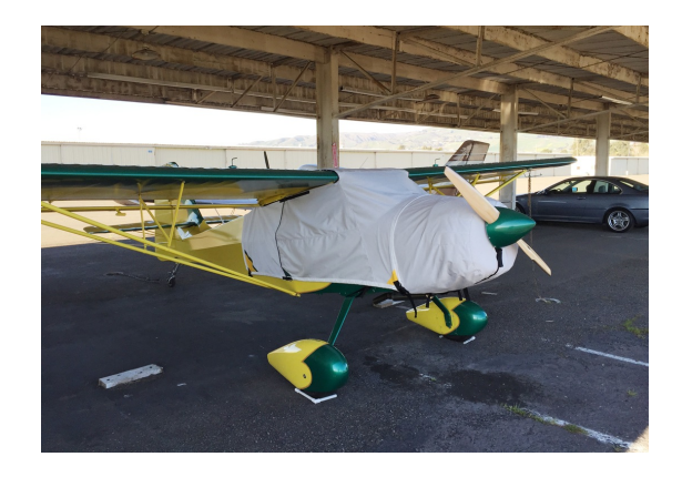
Kitfox Canopy & Engine Covers

Travel Covers are made with Silver Solution-Dyed Polyester fabric and only lined over the windshield to save weight. The material is lightweight and more compact for easy stowage in the aircraft. The polyester material is water resistant, but only intended for occasional use outside. We also have an ultra lightweight material available for fitted hangar dust covers. For daily outdoor use, the non-travel Sunbrella Cover is the best choice.