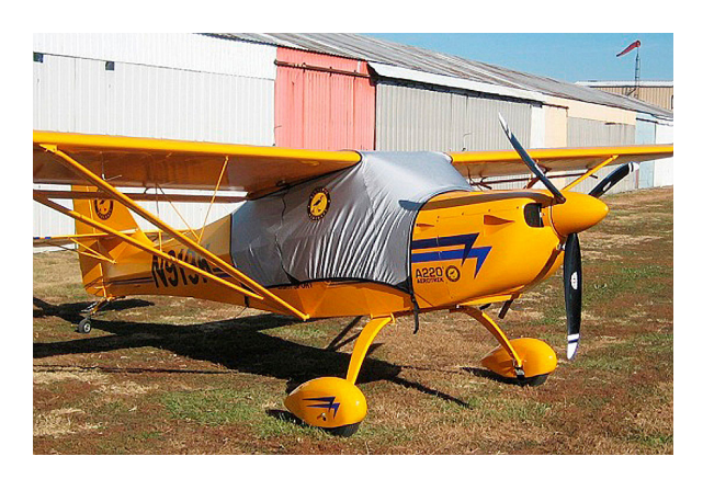
Aerotrek A220 Fitted Hangar Dust Cover

This cover type is made from Silver Acrylic Sunbrella canvas and is 100% lined with a soft and smooth microfiber. Bruce's Custom Covers developed this material combination especially for aircraft protection. The outer material is medium weight and treated for water resistance, UV resistance and anti-static buildup. The inner lining is a very soft and smooth microfiber to prevent scratching. The material is very reflective, and tests show that the cabin interior temperature can be reduced to near-ambient temperature on the hottest of days. It is water, ice and snow repellent, yet breathable to allow moisture to escape from between the cover and the aircraft surface.