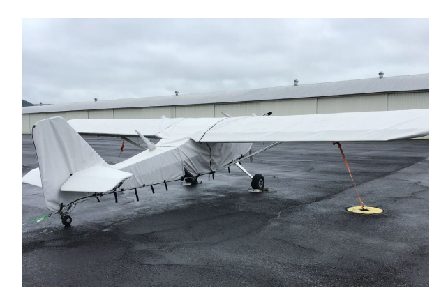
Kitfox 5 Complete Cover Set

This cover type is made from Silver Acrylic Sunbrella canvas and is 100% lined with a soft and smooth microfiber. Bruce's Custom Covers developed this material combination especially for aircraft protection. The outer material is medium weight and treated for water resistance, UV resistance and anti-static buildup. The inner lining is a very soft and smooth microfiber to prevent scratching. The material is very reflective, and tests show that the cabin interior temperature can be reduced to near-ambient temperature on the hottest of days. It is water, ice and snow repellent, yet breathable to allow moisture to escape from between the cover and the aircraft surface.