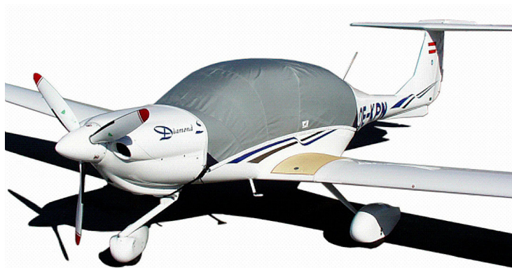
Diamond DA40 Standard Canopy Cover

reflective, and tests show that the cabin interior temperature can be reduced to near-ambient temperature on the hottest of days. It is water, ice and snow repellent, yet breathable to allow moisture to escape from between the cover and the aircraft surface.