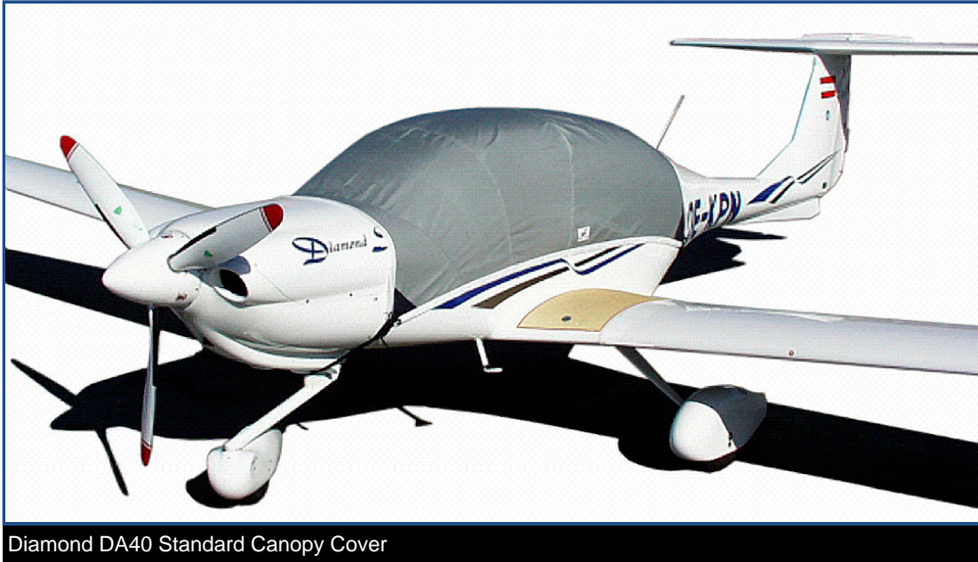
Diamond DA40 Standard Canopy Cover