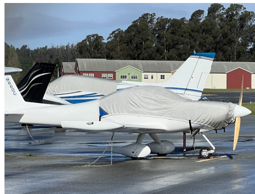
KIS 2-Place Canopy/Engine Cover