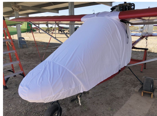
Rans S-12 Airaille Canopy/Nose Cover (test fit cover)