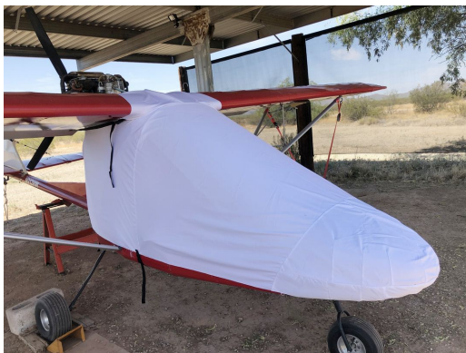
Rans S-12 Airaille Canopy/Nose Cover (test fit cover)

Travel Covers are made with Silver Solution-Dyed Polyester fabric and only lined over the windshield to save weight. The material is lightweight and more compact for easy stowage in the aircraft. The polyester material is water resistant, but only intended for occasional use outside. We also have an ultra lightweight material available for fitted hangar dust covers. For daily outdoor use, the non-travel Sunbrella Cover is the best choice.