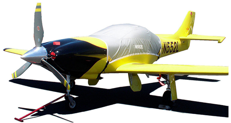
Canopy Cover for Lancair Legacy