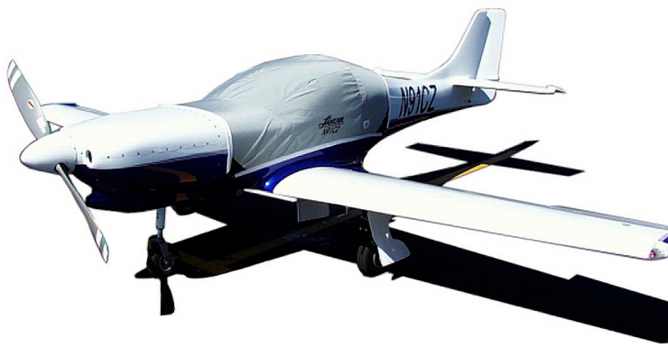
Canopy Cover for Lancair 320/360