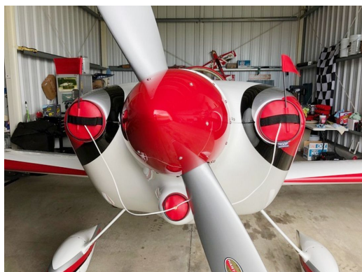
Van's RV-8 Engine Inlet Plugs, Sam James Cowl

Engine Inlet Plugs are custom fit for your Rand-Robinson KR-2 intakes, made with heavy-duty vinyl material, and stuffed with a single block of sculpted urethane foam. Each plug has a zipper that allows the foam to be removed and dried if necessary. Engine plugs have warning flags that are visible from the cockpit or 'remove before flight' streamers sewn onto the face of the plugs. Most plugs are imprinted with the aircraft registration number in black for an extra charge. Storage bag NOT included. Engine plugs may be inserted after flight when the engine is still warm. Engine Inlet Plugs are commonly referred to as Cowl Plugs, Intake Plugs, Cowl Blocks, Engine Blocks, and Engine Bungs.