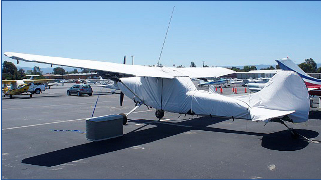
Cessna L-19 Extended Over-the-top Canopy, Engine, Empennage & Wing Covers