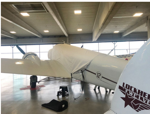
Lockheed 12 Canopy/Nose Cover

This cover type is made from Silver Acrylic Sunbrella canvas and is 100% lined with a soft and smooth microfiber. Bruce's Custom Covers developed this material combination especially for aircraft protection. The outer material is medium weight and treated for water resistance, UV resistance and anti-static buildup. The inner lining is a very soft and smooth microfiber to prevent scratching. The material is very reflective, and tests show that the cabin interior temperature can be reduced to near-ambient temperature on the hottest of days. It is water, ice and snow repellent, yet breathable to allow moisture to escape from between the cover and the aircraft surface.