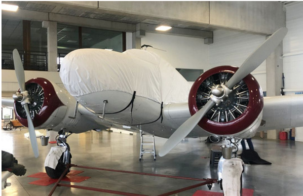
Lockheed 12 Canopy/Nose Cover