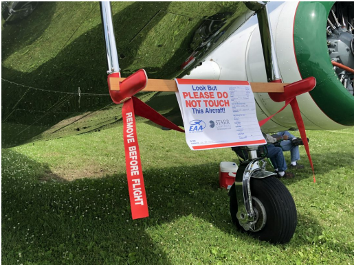
Lockheed 12 Pitot Covers

Lockheed 12 Electra Pitot Tube Covers , NOT HEAT RESISTANT TYPE, are made of Naugahyde vinyl, and are designed to cover the entire pitot assembly. Slipping over the tube, the cover tightens around the base with a Velcro strap detail. A "Remove Before Flight" streamer is attached to the cover. Heat Resistant Pitot Covers are an upgrade to this design, and help prevent the pitot cover from melting onto the tube if the pitot heat is accidentally turned on while installed. If you want the set tethered together, please let us know.