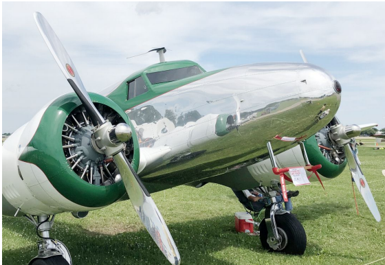
Lockheed 12 Pitot Covers