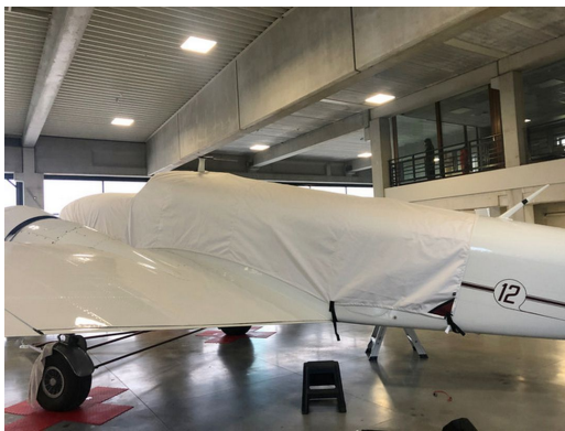
Lockheed 12 Canopy/Nose Cover

This cover type is made from Silver Acrylic Sunbrella canvas and is 100% lined with a soft and smooth microfiber. Bruce's Custom Covers developed this material combination especially for aircraft protection. The outer material is medium weight and treated for water resistance, UV resistance and anti-static buildup. The inner lining is a very soft and smooth microfiber to prevent scratching. The material is very reflective, and tests show that the cabin interior temperature can be reduced to near-ambient temperature on the hottest of days. It is water, ice and snow repellent, yet breathable to allow moisture to escape from between the cover and the aircraft surface.