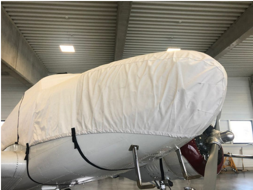
Lockheed 12 Canopy/Nose Cover

This cover type is made from Silver Acrylic Sunbrella canvas and is 100% lined with a soft and smooth microfiber. Bruce's Custom Covers developed this material combination especially for aircraft protection. The outer material is medium weight and treated for water resistance, UV resistance and anti-static buildup. The inner lining is a very soft and smooth microfiber to prevent scratching. The material is very reflective, and tests show that the cabin interior temperature can be reduced to near-ambient temperature on the hottest of days. It is water, ice and snow repellent, yet breathable to allow moisture to escape from between the cover and the aircraft surface.