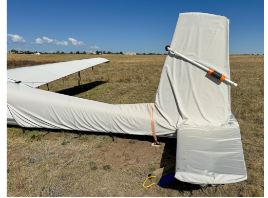
LET L-13 Empennage Cover