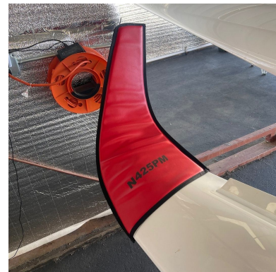
Stemme S-10 & S-12 Wingtip Pads