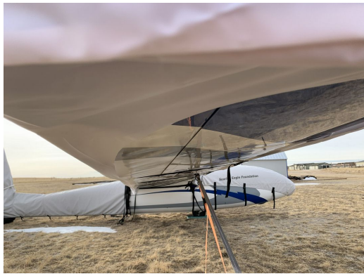
Blanik L-13 Canopy/Nose & Empennage Covers

the hottest of days. It is water, ice and snow repellent, yet breathable to allow moisture to escape from between the cover and the aircraft surface.