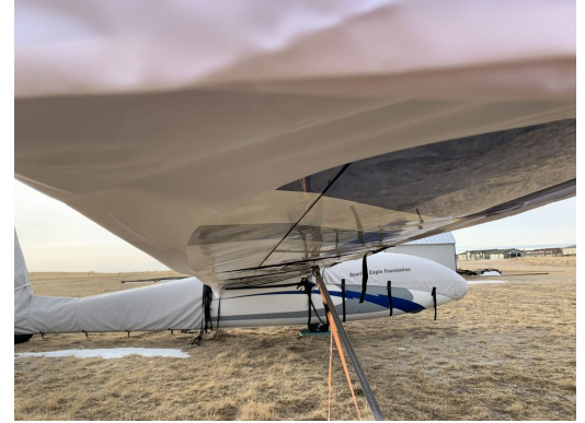
Blanik L-13 Canopy/Nose & Empennage Covers