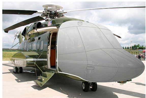
Sikorsky S-92 Windshield/Nose Cover (illustration)