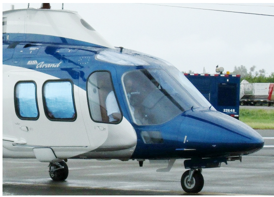
Agusta Grand Cabin & Skylight HeatShields