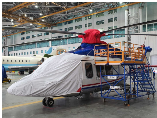
Agusta AW139 Cockpit/Nose, Rotor Mast Cover

This cover type is made from Silver Acrylic Sunbrella canvas and is 100% lined with a soft and smooth microfiber. Bruce's Custom Covers developed this material combination especially for aircraft protection. The outer material is medium weight and treated for water resistance, UV resistance and anti-static buildup. The inner lining is a very soft and smooth microfiber to prevent scratching. The material is very reflective, and tests show that the cabin interior temperature can be reduced to near-ambient temperature on the hottest of days. It is water, ice and snow repellent, yet breathable to allow moisture to escape from between the cover and the aircraft surface.