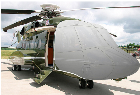
Sikorsky S-92 Windshield/Nose Cover (illustration)

This cover type is made from Silver Acrylic Sunbrella canvas and is 100% lined with a soft and smooth microfiber. Bruce's Custom Covers developed this material combination especially for aircraft protection. The outer material is medium weight and treated for water resistance, UV resistance and anti-static buildup. The inner lining is a very soft and smooth microfiber to prevent scratching. The material is very reflective, and tests show that the cabin interior temperature can be reduced to near-ambient temperature on the hottest of days. It is water, ice and snow repellent, yet breathable to allow moisture to escape from between the cover and the aircraft surface.