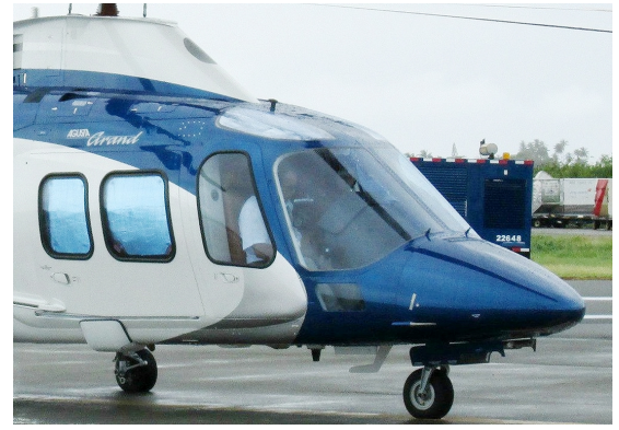
Agusta Grand Cabin & Skylight HeatShields