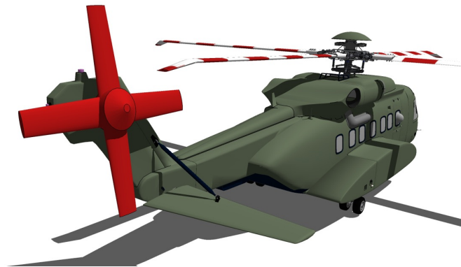
Sikorsky S-92 Tail Rotor Blade and Hub Covers