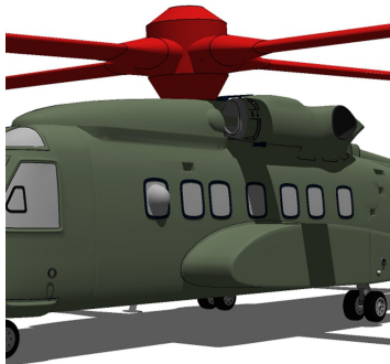
Sikorsky S-92 Main Rotor Hub Cover

WINTER USE MATERIAL - Made with Solution-Dyed Polyester fabric, this option is intended for seasonal use to aid in deicing, rain mitigation, or for occasional travel. The material is lighter and more compact, but more susceptible to UV damage and may have a shorter useful life if used continuously outside than the all-year use material.