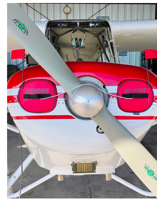
Aeronca 7AC Engine Inlet Plugs