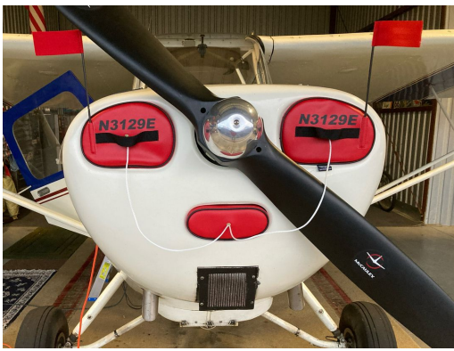
Aeronca Champ Engine Plugs