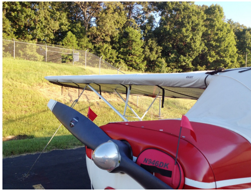
Aeronca Champ Engine Plugs, Wing Covers