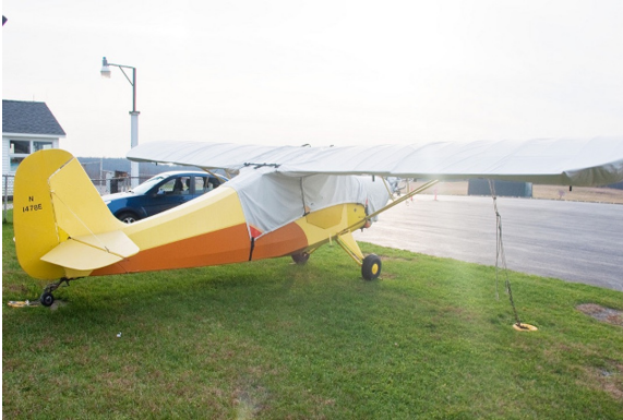
Aeronca 7AC Canopy, Engine & Wing Covers

This cover type is made from Silver Acrylic Sunbrella canvas and is 100% lined with a soft and smooth microfiber. Bruce's Custom Covers developed this material combination especially for aircraft protection. The outer material is medium weight and treated for water resistance, UV resistance and anti-static buildup. The inner lining is a very soft and smooth microfiber to prevent scratching. The material is very reflective, and tests show that the cabin interior temperature can be reduced to near-ambient temperature on the hottest of days. It is water, ice and snow repellent, yet breathable to allow moisture to escape from between the cover and the aircraft surface.