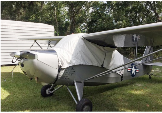
Aeronca L-16A Over The Top Style Canopy Cover