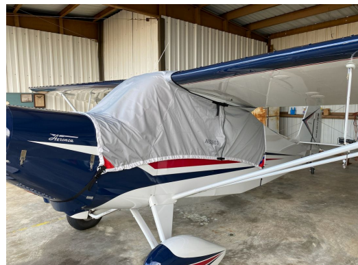
Aeronca Champ Light Weight Travel Canopy Cover, Over-Top Style