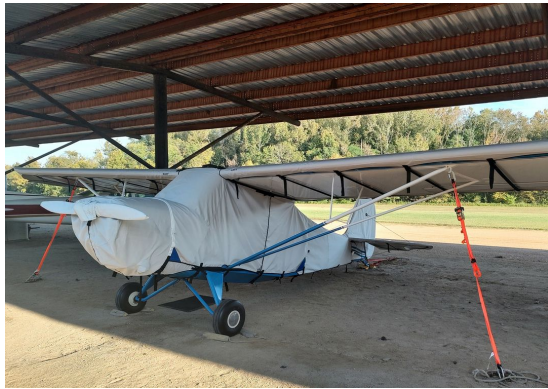
Aeronca Champ 7AC Extended Canopy, Engine, Wings & Empennage Covers

WINTER USE MATERIAL - Made with Solution-Dyed Polyester fabric, this option is intended for seasonal use to aid in deicing, rain mitigation, or for occasional travel. The material is lighter and more compact, but more susceptible to UV damage and may have a shorter useful life if used continuously outside than the all-year use material.