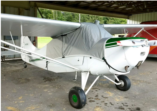
Aeronca Champ Light Weight Travel Canopy Cover, Over-Top Style