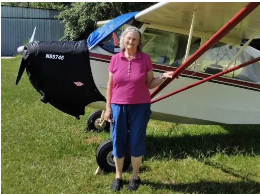
Aeronca 7AC Insulated Engine Cover