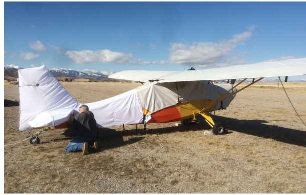
Aeronca Champ Canopy, Wings, Engine & Empennage (test fit) Covers