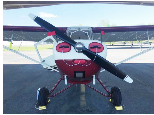
Aeronca Champ 7AC, 7EC Engine Inlet Plugs