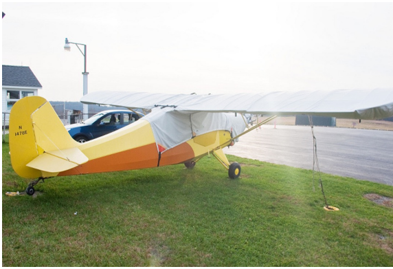
Aeronca 7AC Canopy, Engine & Wing Covers