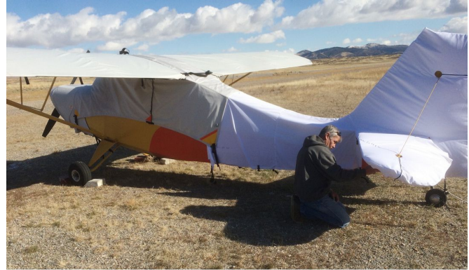
Aeronca Champ Canopy, Wings, Engine & Empennage (test fit) Covers