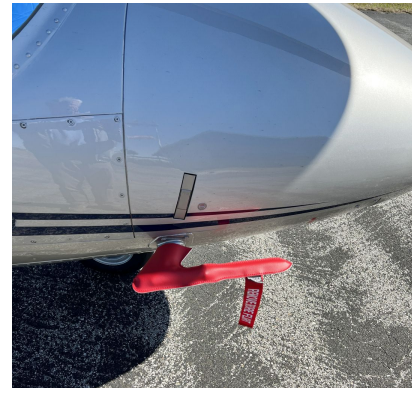
Agusta AW109 (A, C, & Trekker) Pitot Cover Set