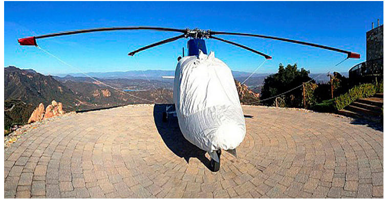
Agusta 109 Mk II+ Bubble Cover and Blade Tie-downs