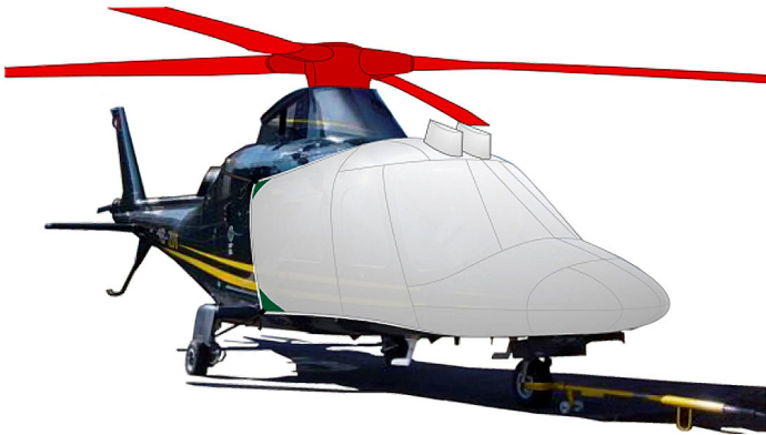
Agusta 109 Bubble, Rotor Hub &amp; Blade Covers (illustration)

Travel Covers are made with Silver Solution-Dyed Polyester fabric and fully lined over the entire cover. The material is lightweight and more compact for easy storage in the aircraft. The polyester material is water resistant, but only intended for occasional use outside. We also have an ultra lightweight material available for fitted hangar dust covers. For daily outdoor use, the non-travel Sunbrella Cover is the best choice.