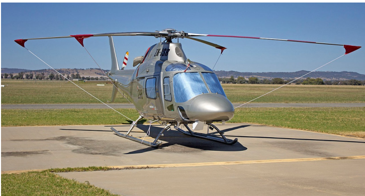
Agusta 119 Cockpit/Cabin HeatShields

Cabin Heatshields are interior sunshades for the aircraft's passenger cabin area. The product is a unique composite of closed-cell foam with a silver mylar finish. The semi-rigid design is stiff enough to stand inside the window framing. The set folds up flat and is easily stored in the included storage sleeve. Some designs may require velcro and suction cups. A Heatshield is an excellent short-term remedy for cockpit overheating, but an external fabric cover is more effective for long-term protection.