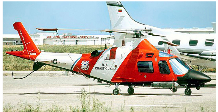
Covers, Plugs, HeatShields and related items for the Agusta MH-68A