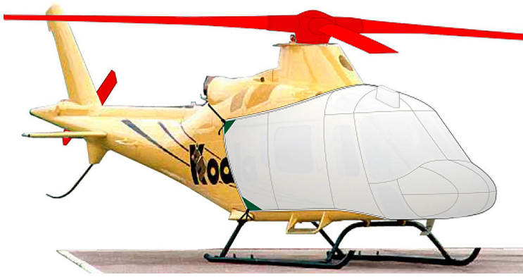
Koala Bubble, Rotor Hub, Blade & Tail Rotor Covers (illustration)