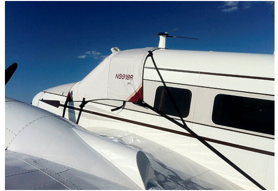
Beech 18 Cockpit Cover