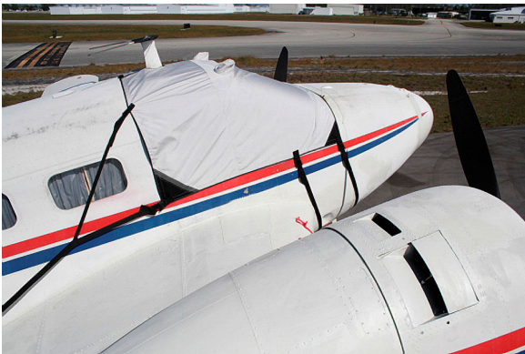
Beech 18 Cockpit Cover