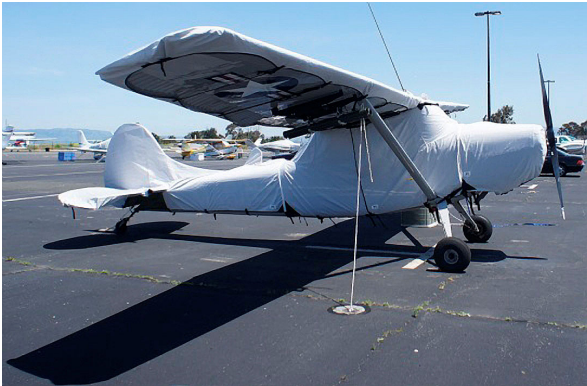
Wing Covers on Cessna Bird Dog