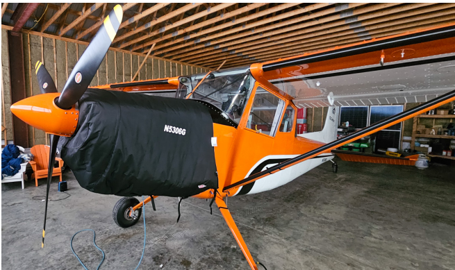
Cessna Bird Dog, L-19, O-1, 305 Insulated Engine Cover

This cover type is made from Silver Acrylic Sunbrella canvas and is 100% lined with a soft and smooth microfiber. Bruce's Custom Covers developed this material combination especially for aircraft protection. The outer material is medium weight and treated for water resistance, UV resistance and anti-static buildup. The inner lining is a very soft and smooth microfiber to prevent scratching. The material is very reflective, and tests show that the cabin interior temperature can be reduced to near-ambient temperature on the hottest of days. It is water, ice and snow repellent, yet breathable to allow moisture to escape from between the cover and the aircraft surface.