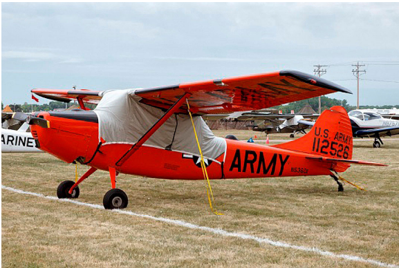
Cessna L-19 Bird Dog Canopy Cover

This cover type is made from Silver Acrylic Sunbrella canvas and is 100% lined with a soft and smooth microfiber. Bruce's Custom Covers developed this material combination especially for aircraft protection. The outer material is medium weight and treated for water resistance, UV resistance and anti-static buildup. The inner lining is a very soft and smooth microfiber to prevent scratching. The material is very reflective, and tests show that the cabin interior temperature can be reduced to near-ambient temperature on the hottest of days. It is water, ice and snow repellent, yet breathable to allow moisture to escape from between the cover and the aircraft surface.