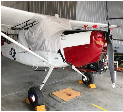
Cessna Bird Dog, L-19, O-1, 305 Canopy Cover, Over-Top Type