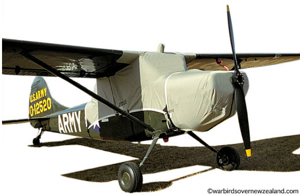
Cessna L-19 Canopy & Engine Covers