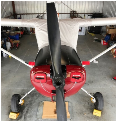
Cessna Bird Dog, L-19, O-1, 305 Engine Inlet Plugs