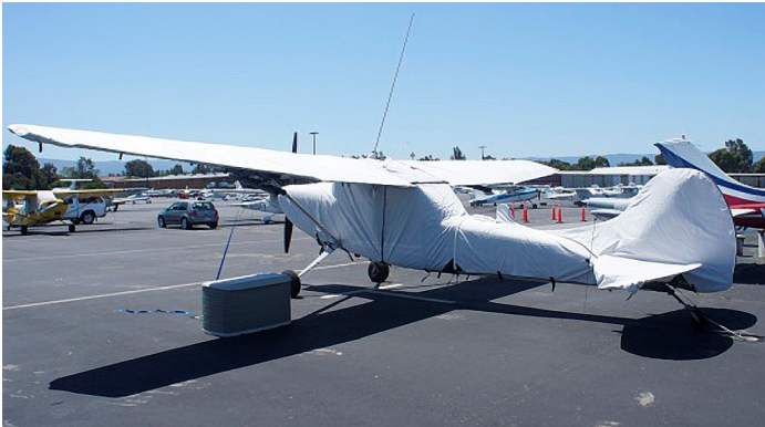
Cessna L-19 Extended Over-the-top Canopy, Engine, Empennage & Wing Covers

WINTER USE MATERIAL - Made with Solution-Dyed Polyester fabric, this option is intended for seasonal use to aid in deicing, rain mitigation, or for occasional travel. The material is lighter and more compact, but more susceptible to UV damage and may have a shorter useful life if used continuously outside than the all-year use material.