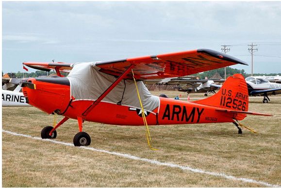
Cessna L-19 Bird Dog Canopy Cover

The material is very reflective, and tests show that the cabin interior temperature can be reduced to near-ambient temperature on the hottest of days. It is water, ice and snow repellent, yet breathable to allow moisture to escape from between the cover and the aircraft surface.