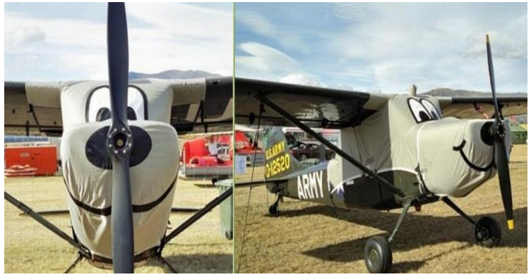
Cessna L-19 Bird Dog Canopy Cover, Engine Cover