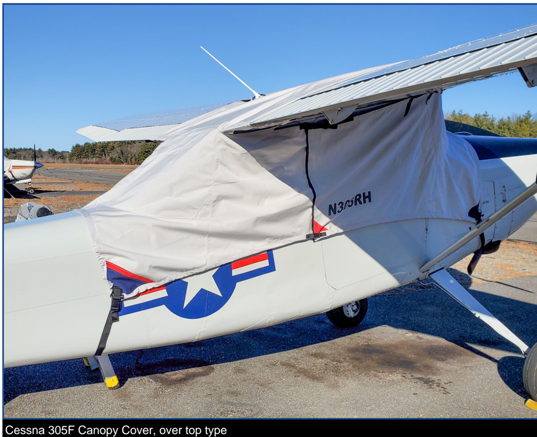
Cessna 305F Canopy Cover, over top type