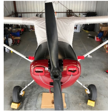
Cessna Bird Dog, L-19, O-1, 305 Engine Inlet Plugs