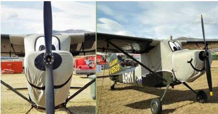
Cessna L-19 Bird Dog Canopy Cover, Engine Cover